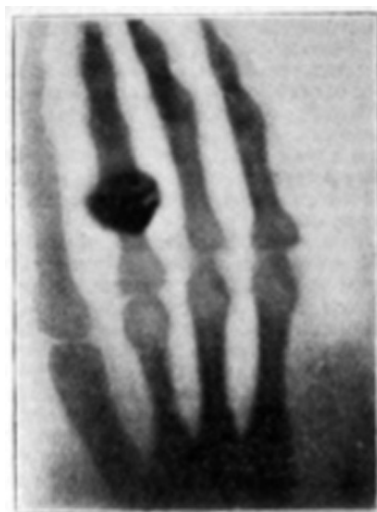
Figure 1 X-Ray image from Röntgen (1896, 276)

Röntgen's (or similar) experimentation will rest upon evidence gleaned from visual perceptual experience. Only the most skeptical of opponents would gainsay. (I am not claiming that we visually perceive X-rays.)