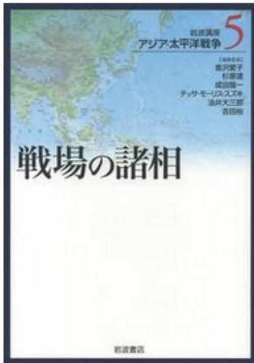
The edited volume containing Yoshida's article, published by Iwanami Shoten

Ajia-Taiheiyō sensō 5: senjō no shosō (2006)