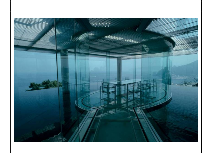
Making a connection: Kuma Kengo's 'Water/Glass' structure in Atami, Shizuoka Prefecture, attempts to connect architecture with the sea by means of a veranda of water.

"I wanted to go to a place that wasn't neat and tidy, somewhere dangerous. I was bored, and it had something to do with the era and something to do with myself too."