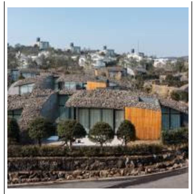
Jeju Ball Hotel

There is a porousness in Kuma's structures that enhances the qualities of his materials. This is even true of some stone in his work. He laid volcanic rubble over the low sloping roofs of the buildings of the Jeju Ball hotel on South Korea's largest island of Jeju. (The island boasts more than 300 lava cones.) The roofs and the ground are linked in texture, and light from skylights scatters shadows. There is a randomness to the way the light falls and fragments. The connection here, between the natural and the artificial, is produced in the eye of the beholder.