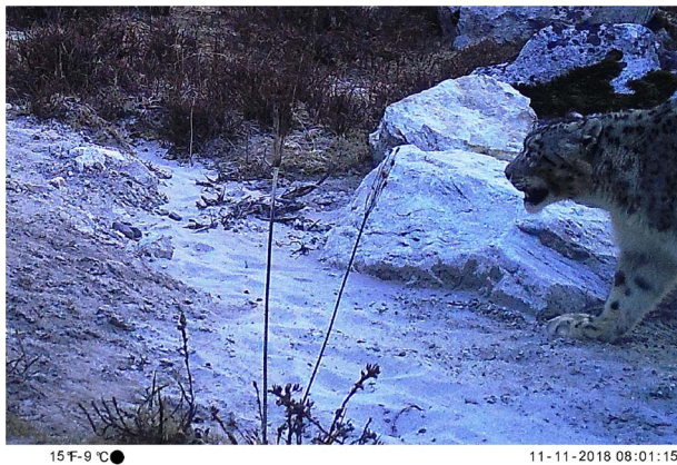
PLATE 1 Snow leopard photo-trapped in Gaurishankar Conservation Area (Fig. 1).

photographs of a snow leopard, the first photographic evidence of the presence of the snow leopard in Lapchi Village and the Lamabagar corridor (Plate 1). Whether this snow leopard was a seasonal visitor or has a permanent home range in the area will require further study. The camera that captured the snow leopard recorded four other mammalian species: musk deer, blue sheep, red fox Vulpes vulpes and bobak marmot Marmota bobak .