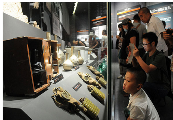
Visitors look at exhibits at the Museum of Evidence of War Crimes by Japanese Army Unit 731, in Harbin, Heilongjiang province, on Aug 15, the day the museum opened to the public.

"And I found out for the first time about the Americans. Why didn't they prosecute them? I felt that was really hard to accept. Definitely, Chinese people will feel that way," she said.