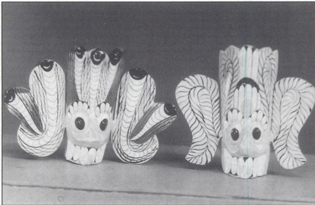
Fig. 1. Examples of the masks worn by exorcists.

Postgraduate psychiatric training consists of a five-year compulsory training period. The