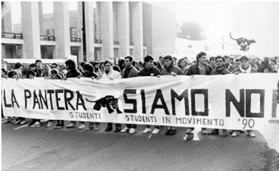
Figure 2. Symbol of the Black Panther Party, adopted as a logo by the Pantera movement.

terms: ‘the partisans who fought against Fascism also fought against that regime’s anti-semitism. It is no stretch to connect the partisan struggle of 45 years ago with the antiracist battle of the present day’ (Il graffio della pantera 1990b).