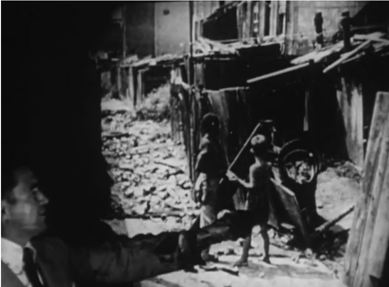
Figure 3: Still frame from documentary film, Baltimore Plan , produced and directed by John Barnes, 1953.

hit hard. To the people of Baltimore, such conditions were impossible. But there they were, as common as the daily paper. 77