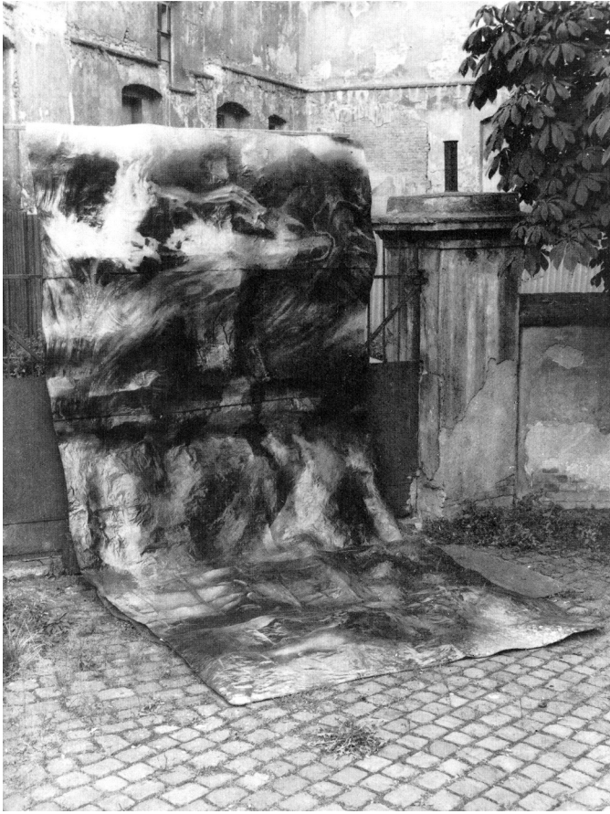
Figure 5. Nadja Rawa, K obrazu svému / In Your Own Image , 1987, mixed media, 680 x 260 cm, © Nadja Rawa

Yugoslavia). 57 Regardless of the medium, more male, sometimes chauvinistic groups, such as Łódź Kaliska in Poland, began to assert themselves in the east as part of the neo-avant-garde or counterculture of the period. 58 On the other hand, it certainly did not change the fact that women artists in socialist countries pursued postmodern painting and sculpture. Many of my interviewees also worked with postmodern approaches or aesthetics. Bohuslava Olešová, Marie Birchler Suchánková, and Eva Prokopcová made large-format expressive color objects and drawings. Nadja Rawa mixed styles between painting, photography, and objects. Eva Vejražková focused on “wild” paintings outside the rectangular format that were transformed into installations (Figure 5).