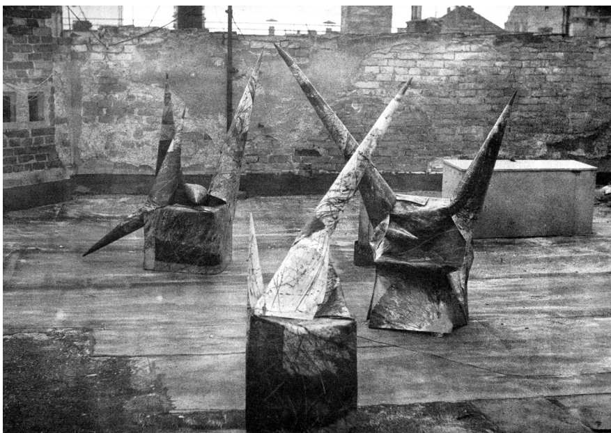
Figure 1. Bohuslava Olešová, Bez názvu / Untitled , 1987, mixed media, © Bohuslava Olešová