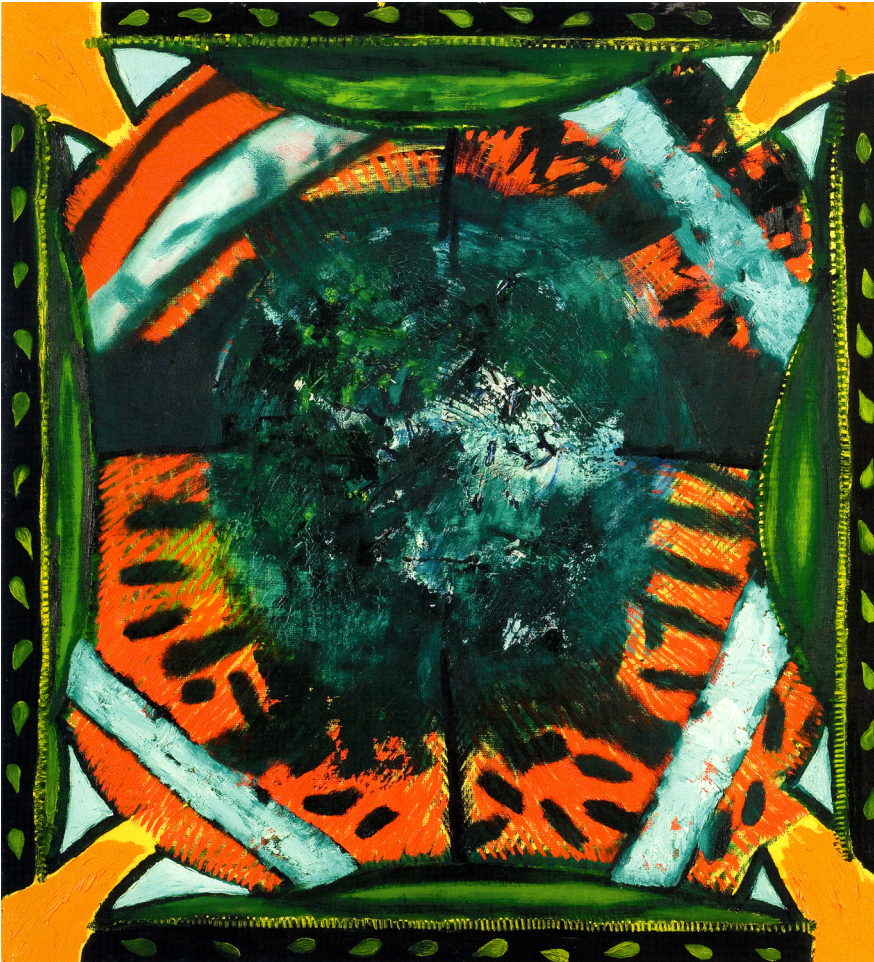
Figure 3. Eva Prokopcová, Zevnitř ven / From the Inside Out (cyklus Čtverce / Square series ), 1987, oil on canvas, 100 x 90 cm, © Eva Prokopcová

was considered a career achievement for an applicant, some of whom applied for eight years in a row, even to be accepted.