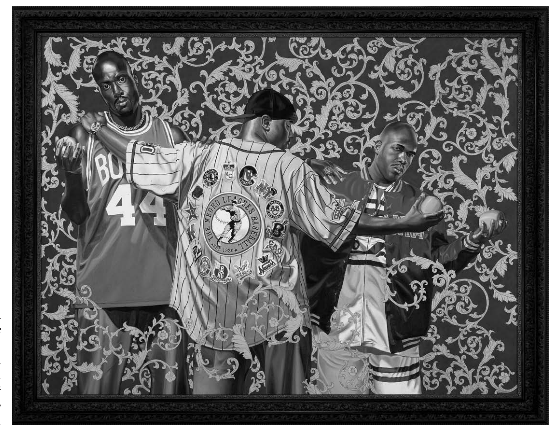
FIG. 1 Kehinde Wiley, Three Graces , 2005. Oil and enamel on canvas, 182.9 × 243.8 cm. By permission of the Kehinde Wiley Studio.

We're close to Carpentier's baroque as utopia, but the juxtaposition of Wiley's guys off the street and great inherited wealth should give us pause. Black men encounter discrimination on the job market, compose the largest proportion of the male prison population, and have the poorest health care of any Americans. Wiley told journalists that