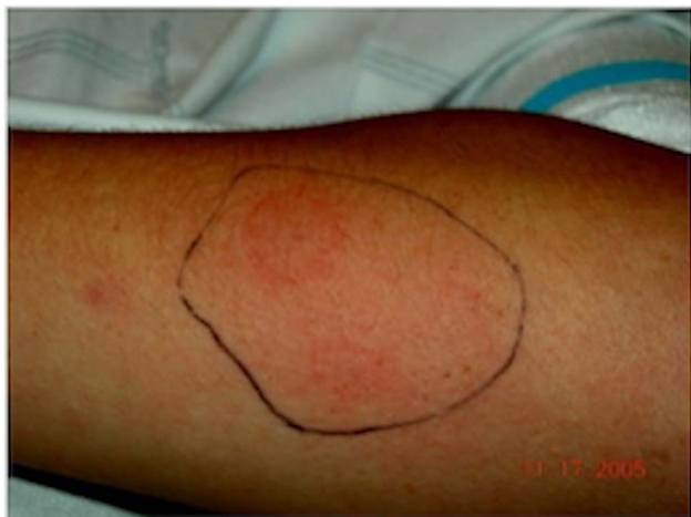
Figure 2. “Target lesion” characteristic of black widow spider envenomation.