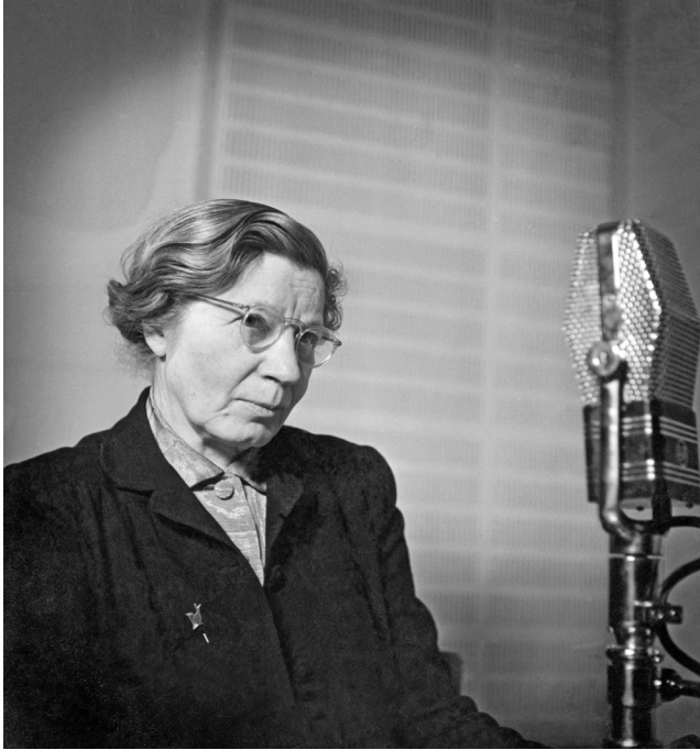
FIGURE 2.2 Elin Wägner, early feminist with ecological ideas. Her anti-war pamphlet Väckarklocka [Alarm Clock] (1941) is generally considered Sweden's first articulation of a program for a responsible lifestyle that cared for the qualities of unspoiled nature and home-grown food.

critique of the misconstrued economy and norms of modern, militaristic society. A central theme in both books were issues that would be called “environmental”: resource waste, pollution, food security, erosion, and decaying soils.