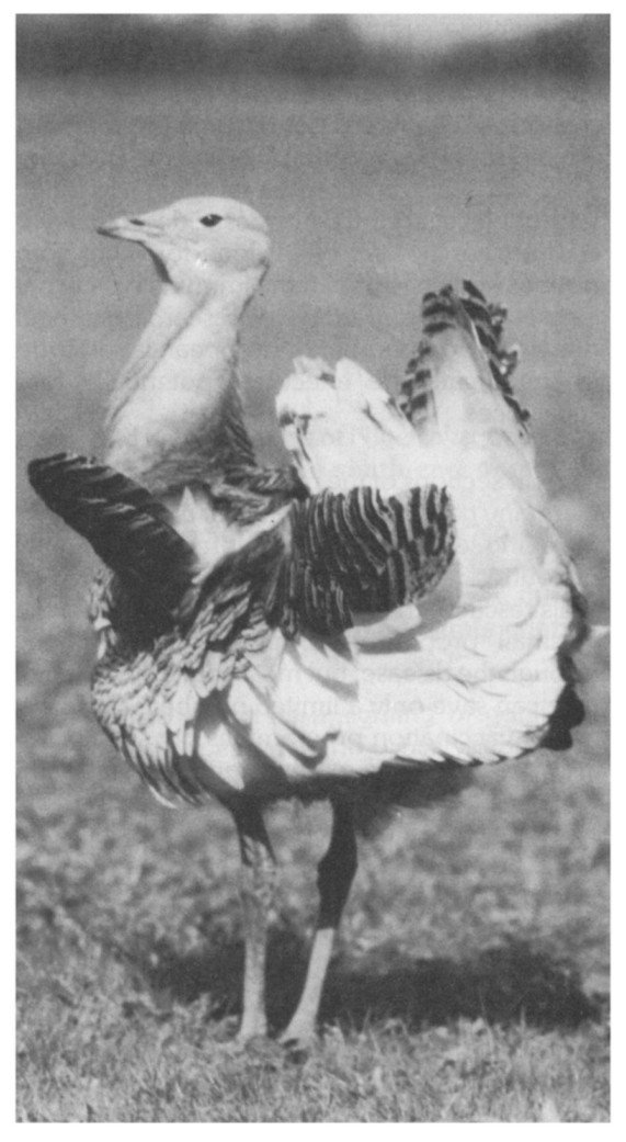
Great bustard: declining in Europe, but help is on the way (Andrzej Bereszynski).

that seems not to work in the case of the great bustard. Accordingly, the new policy recommended by the Group emphasizes the importance of protecting the habitats used by bustards, both during the winter and breeding seasons. Thus, areas of winter green crops, including rape, alfalfa, cabbages and clover, have to be reintroduced in intensively cultivated areas to provide winter feeding grounds. In the breeding season, large plots have to be left fallow, where the males can display and females can approach them for mating without disturbance. The recent addition of the great bustard to Annex II of the News and views