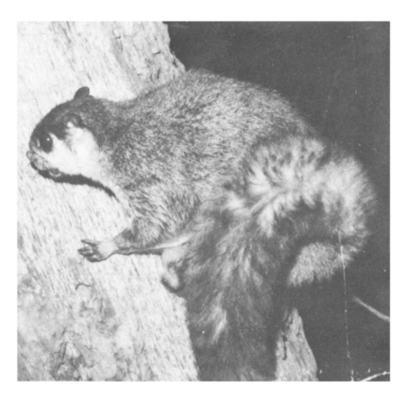
The small Travancore flying squirrel, photographed for the first time ever (G. U. Kurup).

Vennikkulam is a riverside village on the banks of Manimala river, with a small trading centre. The nearest forested area is about 24 km away to the east in the Ranni Forest Division. The area is cultivated with coconut, arecanut, sugar cane, paddy, and additionally, of late, cocoa. There is also some riverine vegetation, thick in places, along the banks of the river. The plot of land from which the squirrel was collected had all these vegetation types. Though the area was further explored, especially the crowns of all the coconut palms in the area, no other individual was seen. However, the area remains to be explored further with some intensive surveys in the Ranni Forest Division.