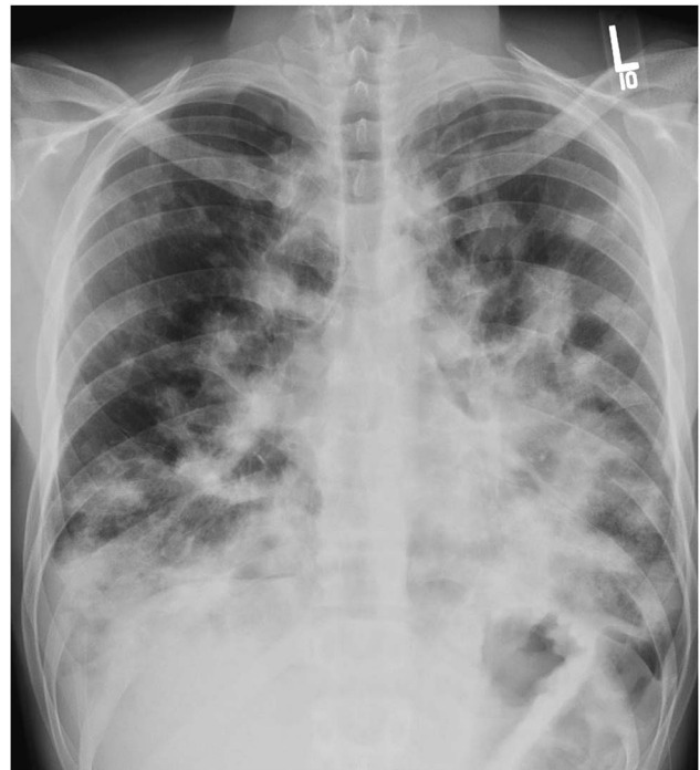
Figure 2. Subsequent chest radiograph demonstrating worsening opacities.

From the *Department of Emergency Medicine, Cook County (Stroger) Hospital, Chicago, IL.