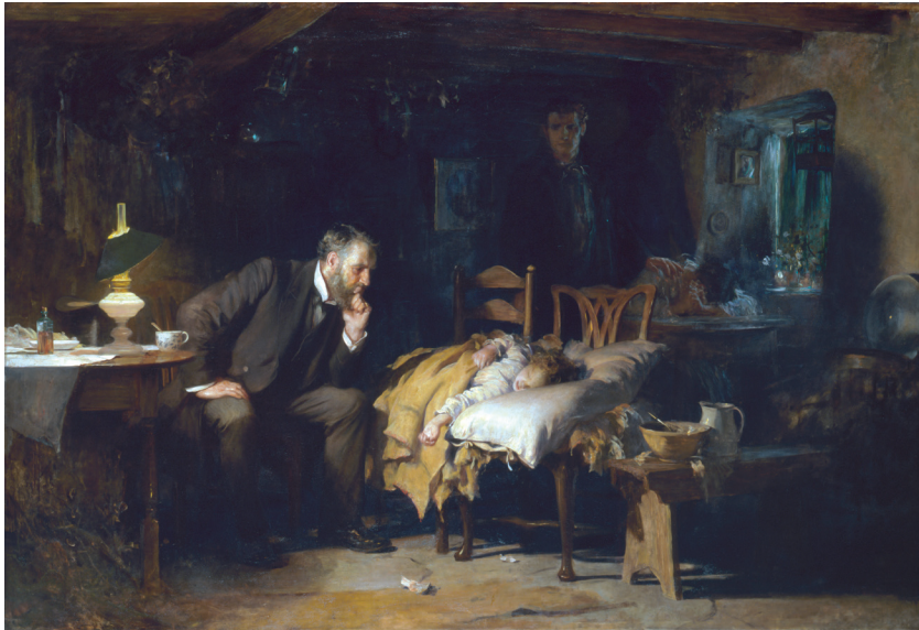
Figure 6.2 Luke Fildes, The Doctor (1891). Item No. N01522. Tate.

Fildes himself remarked, 'He should be the actor in the little drama I had conceived – father, mother, child should only help to show him to better advantage'. 135 As with 'The Doll Episode', here the child's parents (and even the child herself) serve merely as witnesses to professional compassion and selflessness. Moreover, as a number of commentators have pointed out, by focusing on the supposedly timeless relationship between doctor and patient, Fildes' painting presented a vision of professional practice that was, in many ways, antithetical to the reality of modern medicine. 136 Indeed, in the United States, The Doctor functioned for many decades as a palatably homely means to assert the moral value of an individualised, free-market form of healthcare in the face of more bureaucratic and statist models. 137 Within the context of late nineteenth- and early twentieth-century Britain, however, it represented an attempt to reconcile the triumphs of techno-scientific medical modernity with popular sentimentalism and established notions of care.