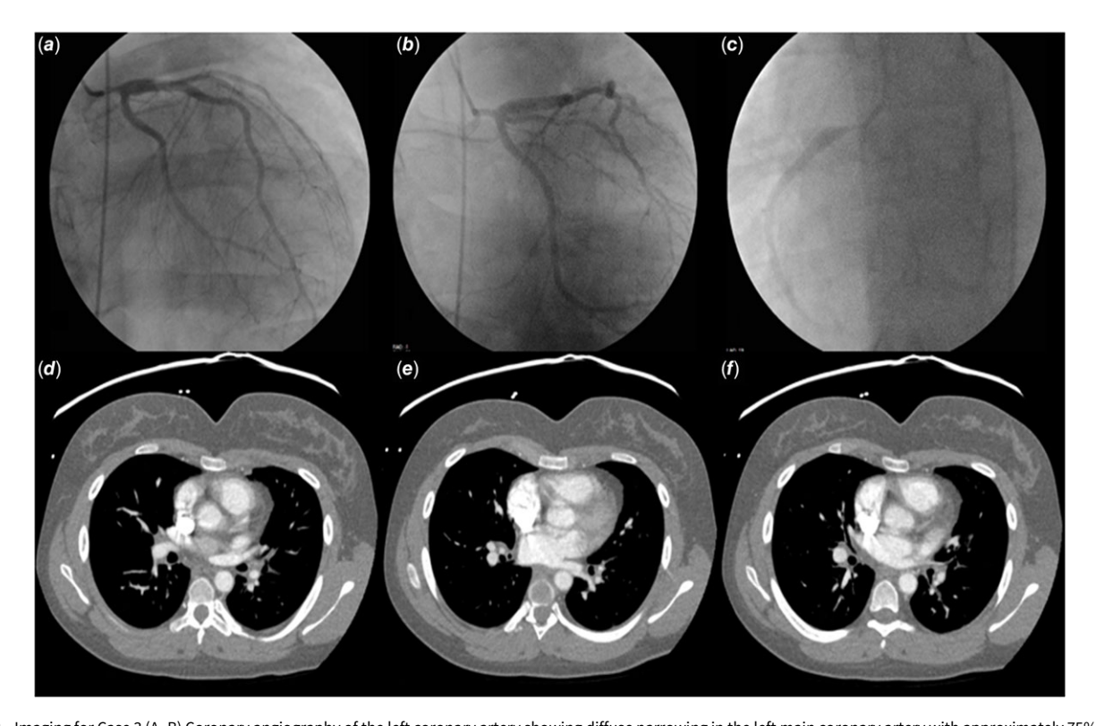
Figure 3. Imaging for Case 3 (A–B) Coronary angiography of the left coronary artery showing diffuse narrowing in the left main coronary artery with approximately 75% stenosis; (C) coronary angiography of the right coronary artery showing diffuse proximal narrowing with approximately 80% stenosis; (D–F) cardiac computerised tomographic angiography demonstrating mild aortic arterial wall thickening.

function, and a follow-up CT chest demonstrated vague soft tissue thickening of the ascending aorta and proximal to mid-descending aorta with a mild outpouching along the medial aspect of the descending thoracic aorta (Fig 3). The patient also had a history