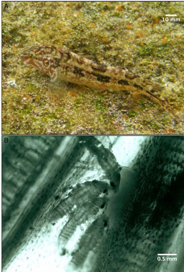
Fig. 2. (A) Clinus superciliosus . (B) Gnathia africana parasitizing Clinus superciliosus .

correlated with TL ( r^2 = 0.000 , P = 0.877 ). The mean total number of gnathiids was greatest during morning and afternoon, and lowest during early morning (Figure 3). The average number of stage 1, 2 and 3 gnathiids collected was 0 + 4, 0 + 1 and 0 + 1, respectively. The TL data were not correlated with the number of stage 1 ( r^2 = 0.003 , P = 0.437 ), 2 ( r^2 = 0.009 , P = 0.224 ) and 3 ( r^2 = 0.007 , P = 0.263 ) gnathiids.