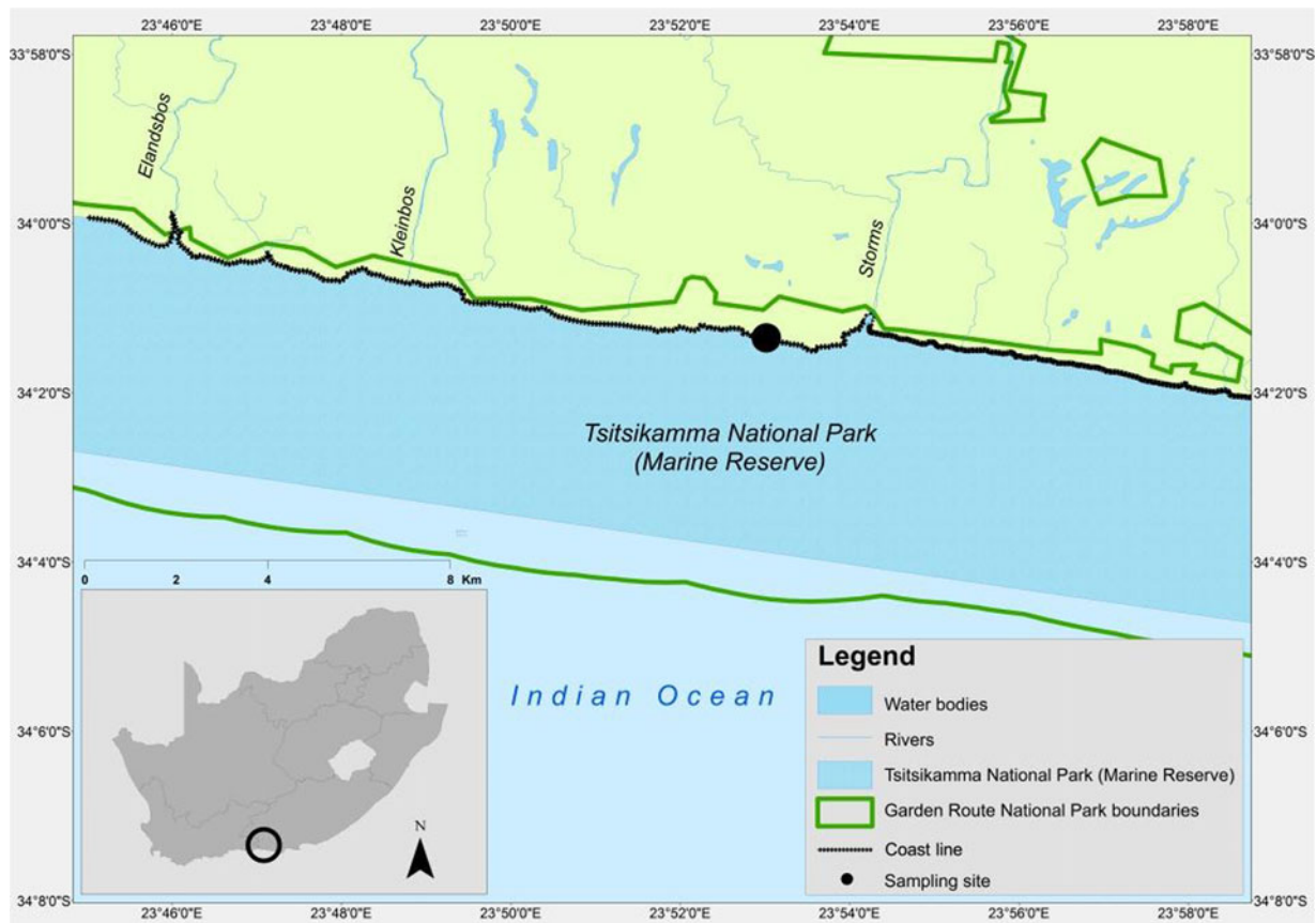
Fig. 1. Map of study site within Tsitsikamma National Park, South Africa.