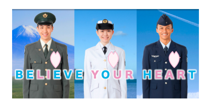
Fig. 1: The new Self-Defense Forces public relations line of 2014, "Believe your heart." The video clip with the same "Believe your heart" rhetoric and aesthetic can be found here:

http://www.youtube.com/watch?v=X-Wt3Nl-HV o (Sakura Channel, 8/12/2014).