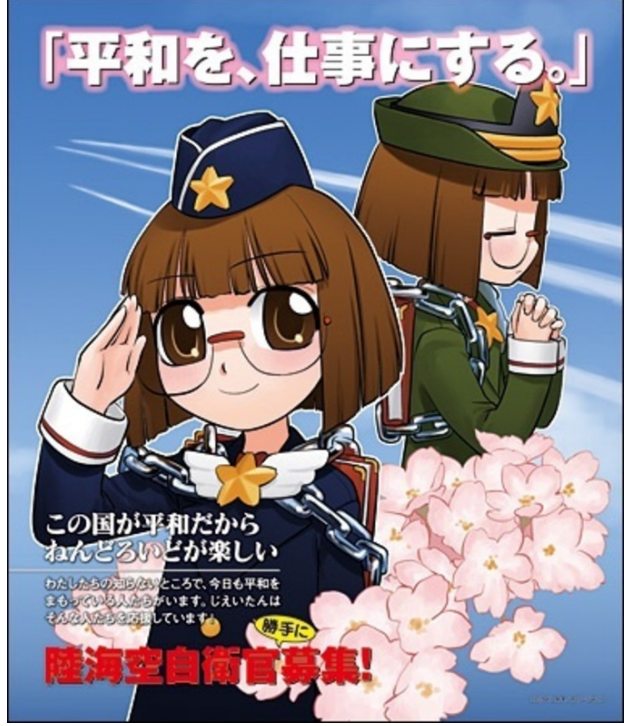
Fig. 2: More recruitment material following the 2011 triple disaster in northeastern Japan promises that once in the Self-Defense Forces, a service member would surely "love oneself," due to the fact that they "make peace their business."

http://www.youtube.com/watch?v=X-Wt3Nl-HV o (Sakura Channel, 8/12/2014).