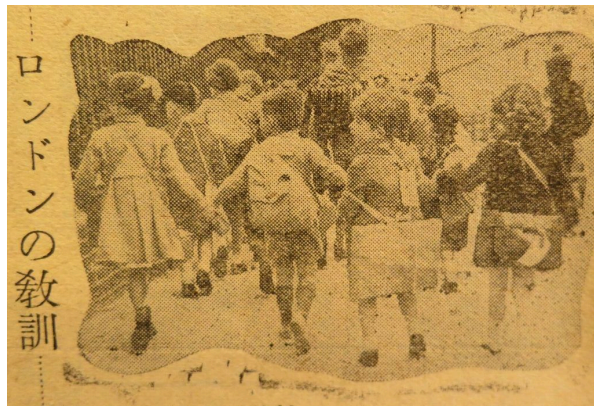
Figure 5. “The Lessons of London.” In this 1944 article in the Japanese government’s civil defense magazine, a diplomat previously stationed in the Japanese embassy in London describes what his countrymen might learn from the evacuation of children from British cities at the start of World War II.

Source: Tobe Toshio, “Rondon no kyōkun,” Kokumin bōkū 6, no. 7 (July 1944): 37.