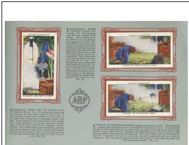
Figure 3. Commissioned by Britain’s Home Office, these prewar cigarette cards—found in cigarette packs—illustrate methods by which women could neutralize incendiary bombs that crash through the roofs of their homes. The use of stirrup pumps and sand closely resemble German techniques in Figure 1.

Source: Source: W.D. & H.O. Wills, Air Raid Precautions: An Album to Contain a Series of Cigarette Cards of National Importance ([Great Britain]: W.D. & H.O. Wills, 1938), nos. 13-15.