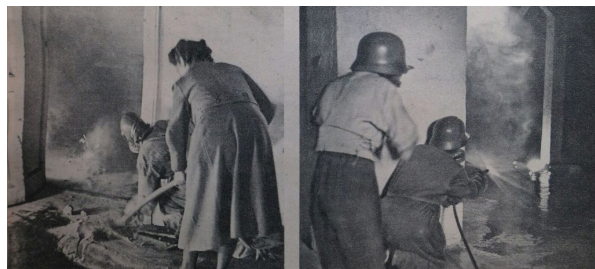
Figure 1. In the Reich Air Defense League’s magazine, wartime German women drill in extinguishing British “stick” firebombs by shoveling sand or spraying water.

This unprecedented mobilization of civilians was provoked, to a significant degree, by new technologies of destruction across the globe. The specter of gas warfare prompted several European countries and Japan to train civilians in decontamination from the early 1930s. 6 As the major powers ratified the 1925 Geneva Protocol that prohibited chemical and biological weapons, the threat of gas bombs receded. More menacing were new types of incendiary bombs—thermite, phosphorous, and magnesium. These typically small “stick” bombs, weighing from 1 to 2.7 kg (2.2 to 6 lb), could be dropped by the tens of thousands. By the end of World War II, the U.S. Army Air Force’s B-29 Superfortress bombers could each drop 1,520 M-69 napalm bombs.