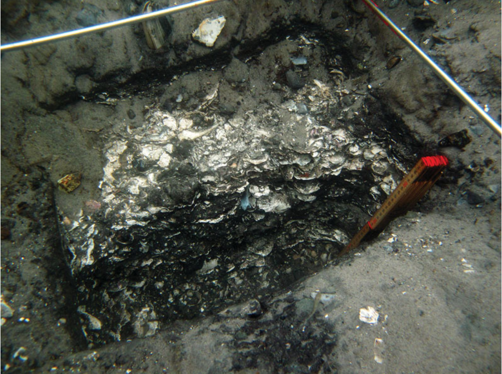
Figure 5. Excavation of an underwater shell midden at Hjørnø in Denmark.

The first step is to compile information on known onshore archaeological sites in the Pilbara region, their palaeoenvironmental and topographic associations, and to examine existing offshore marine survey data. This will be amplified using airborne survey combining bathymetric LiDAR equipment capable of achieving sub-0.5m scale mapping to water depths of approximately 10m, and high-resolution topographic LiDAR and stereo-imaging cameras. The objective here is to provide a detailed understanding of known onshore archaeological sites in their topographic and landscape setting, and to develop a preliminary understanding of the offshore bathymetry and underwater features of potential archaeological and palaeoenvironmental significance.