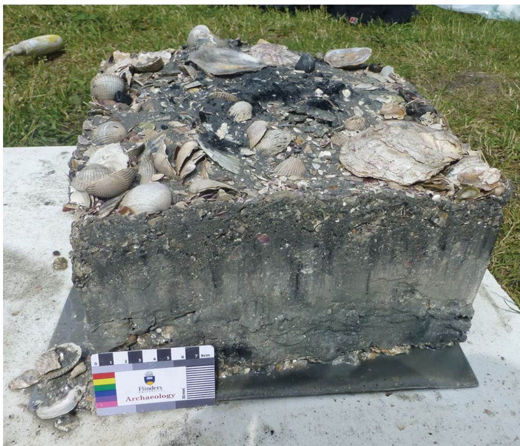
Figure 6. Block removal of an undisturbed section of the Hjarnø shell midden deposit and potential hearth feature.

and their associated sediments with geophysical survey using sidescan sonar and high-resolution three-dimensional bathymetry. Thus, we intend to establish the acoustic and geoarchaeological signals associated with submerged and buried midden deposits (Figure 6). We expect the results of this work to feed into the search for underwater archaeological material in the Pilbara region, and to be of global interest and relevance to underwater research.