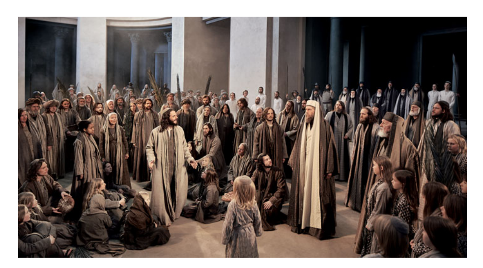
Fig. 6 This image shows Jesus opposite Caiaphas, the high priest, and with a diverse crowd of many constituencies around them. Critics point out that even with a crowd comprising multiple constituencies, the colours of these costumes are mostly limited to various shades of grey and brown. They differ in their materials – one can see that the high priests' clothes are made of much finer fabrics – but the contrast of colour and shape is not nearly as stark as it was in previous iterations, when the High Council wore enormous hats and much more colourful robes.

There are a few who have objected: they do not like Christian Stückl, they do not like the way he 'hoards power' among an inner circle of associates (in their view), and almost invariably they criticize his new choices.<sup>58</sup> One, for instance, told us that he thought the