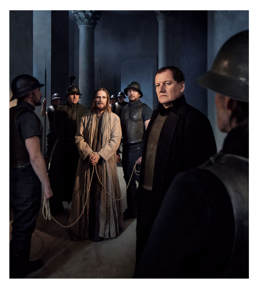
Fig. 2 The captured Jesus, held by Roman soldiers, stands before the powerful Pontius Pilate.

Other changes may be very significant to locals, though may not appear tremendously consequential to outsiders. The play's action has always been punctuated by choral music, and the choir has always (or at least since 1811) been accompanied by a narrator, called the Prologue, who explains the theological significance of the action in prose. But the Prologue, for the first time, was cut entirely in 2022: the 2022 audience is left to interpret the action for themselves. And the choir, which had previously been costumed all in white, giving an angelic aesthetic, are now costumed in 2022 like seventeenth-century Bavarian villagers: they represent the original Oberammergauers who started this tradition (Fig. 4).