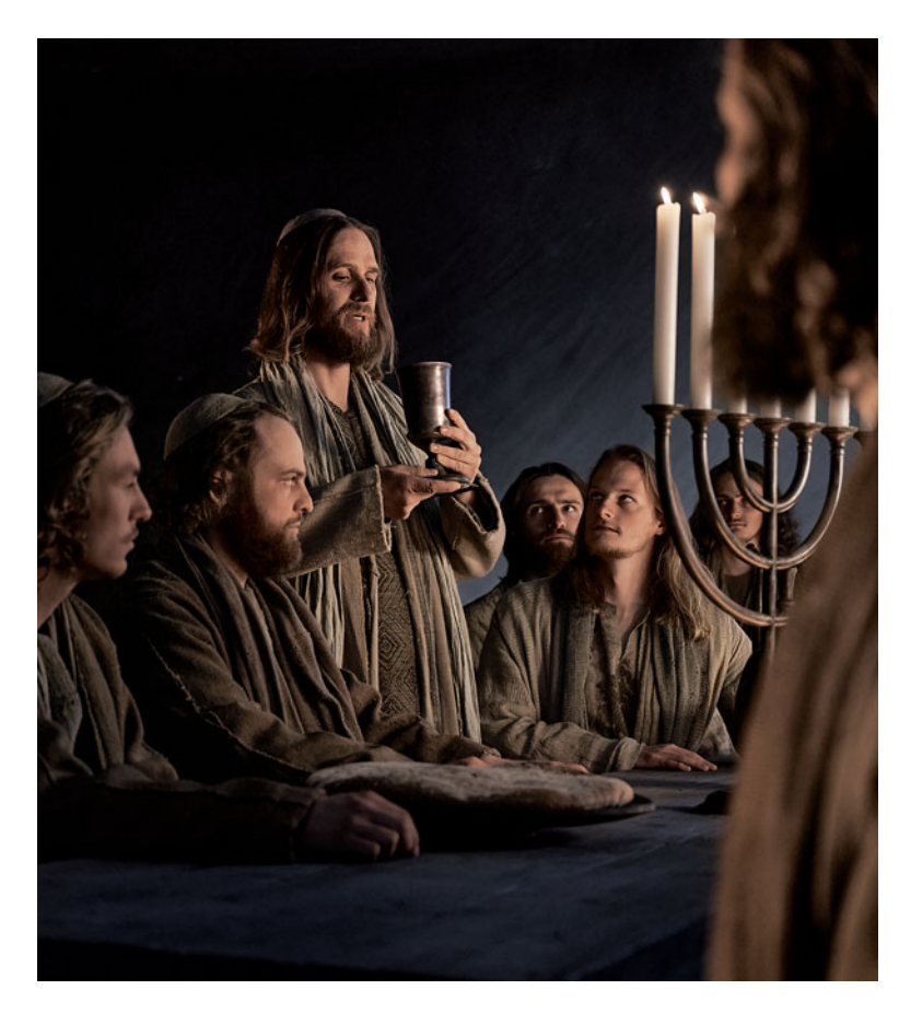
Fig. 1 This image shows the Last Supper, as depicted in the 2022 Passion Play. Note that Jesus and his followers all wear kippot, and are all costumed to match the Jewish crowds of Jerusalem. The Last Supper is lit by the seven-branched menorah – a historical anachronism (as this object was part of Temple ritual, not home ritual) but one that clearly demarcates the Passion Play's 'good guys' as quintessential Jews. As Jesus holds up this glass of wine, he speaks not the liturgy associated with communion ('This is my blood'), but rather the traditional Jewish blessing over wine.

debated and collaborated as they worked through the finer details of the script and dramatic action.