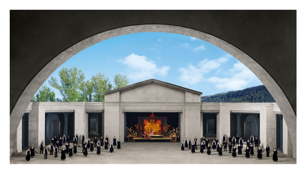
FIG. 4 The Oberammergau choir, costumed in the 2022 production as the seventeenth-century Bavarians who initiated the Passion Play tradition, sing without a central narrator, who used to be called the Prologue. At the centre of this image is a tableau of the Garden of Eden – one of many tableaux depicting Hebrew Bible narratives interspersed throughout the Passion Play.