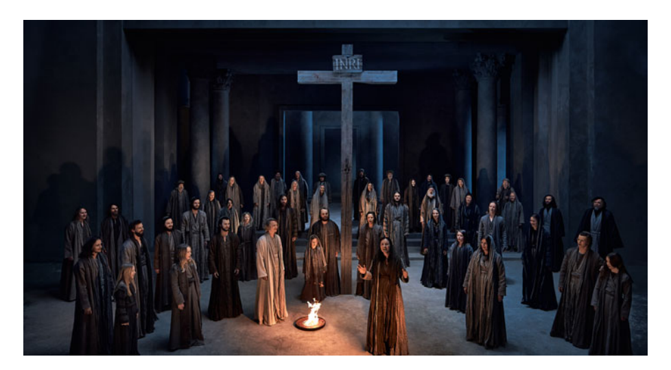
Fig. 5 The 2022 Oberammergau Passion Play stages the Resurrection without a resurrected Jesus physically present. Mary Magdalene, pictured downstage centre, looks out over the audience and declares that Jesus has returned. Near her stands an angel, who has brought on a giant flame, and around them stand the choir. The choir, here representing a subset of the larger community, ultimately take out candles and light them from the giant flame, before exiting.

friend, as a gesture of forgiveness and acceptance. He tried it out in rehearsal, spontaneously, and then kept it, with the approval of the director.<sup>52</sup> Another performer told me that the actors, in small groups, were constantly initiating smaller, subtler adjustments, on their own initiative, as they discussed problems and attempted to solve them. So, for example, at one of the final rehearsals, the group of actors playing apostles got together with the group of Temple Guard soldiers to discuss and rework the sequence of events at Jesus' arrest. 53 He said that he does not think they initiated changes on their own quite so much in past iterations, but that now, there is such an embrace of experimentation as a way of working that they do so organically.