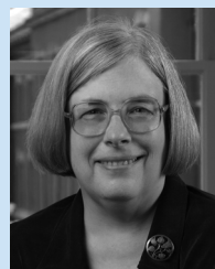
Theda Skocpol

The AAC&U is a national association concerned with the quality, vitality, and public standing of undergraduate liberal education and seeks to extend the advantages of a liberal education to all students, regardless of academic specialization or intended career. For more information, see http://www.aacu.org/ .