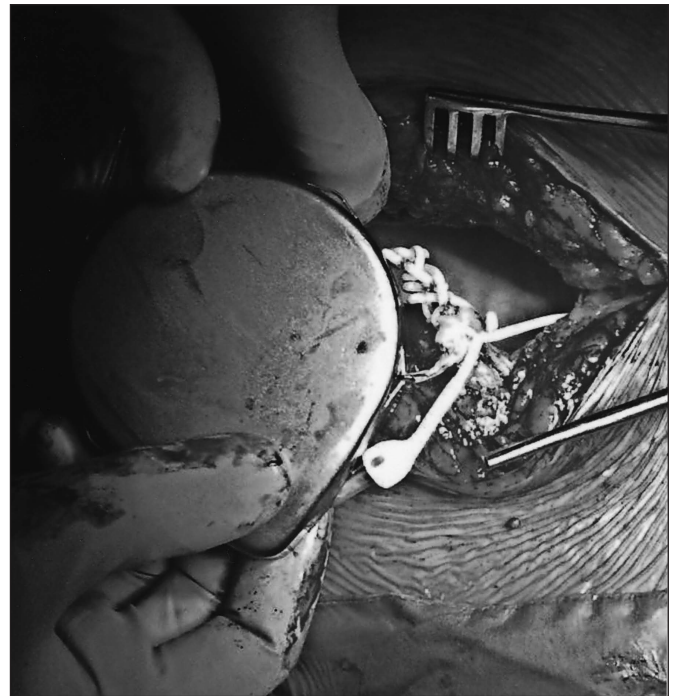
Figure 2: The pump catheter was found in a large knot during surgical revision.

Twisting of the catheter is a rare complication of ITB pump systems. It is important that physicians be aware that it is a potential complication and recognize the signs of pump malfunction. It is possible to decrease the risk of pump rotation by reducing the size of the incision and abdominal pocket volume, and ensuring proper anchoring of the pump within the pocket.