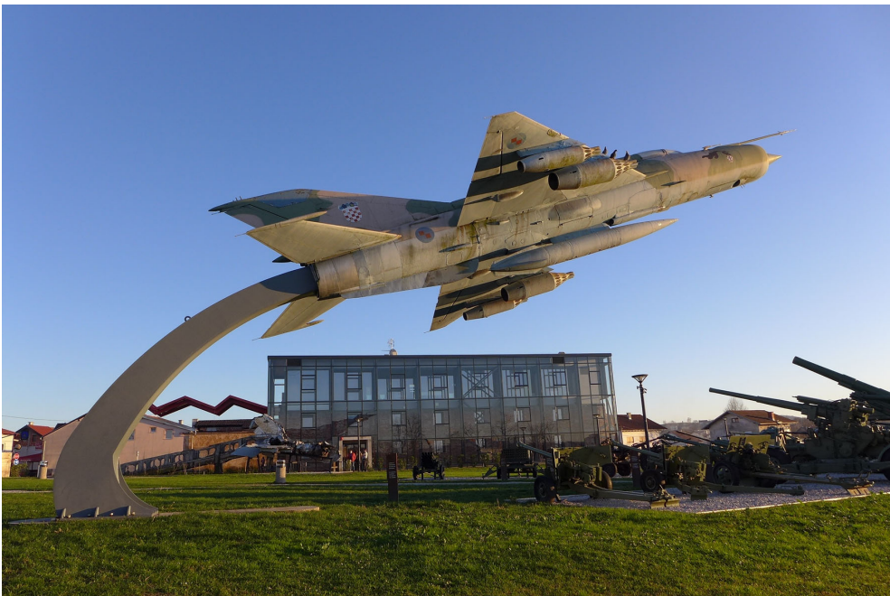
Figure 2. The Museum of the Homeland War in Karlovac after the opening, © Author.