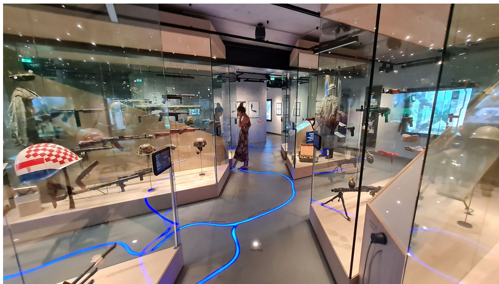
Figure 3. The main exhibition room in Karlovac, © Author.

I thus argue that firstly, the Croatian (and Bosnian) museums differ from other post-1989 redesigned or newly opened museal institutions in Central Eastern Europe because in the post-Yugoslav context the focus is not on the Communist crimes but on the 1990s wars. Secondly, Karlovac is a typical example for Croatian museums that, to a striking degree, dismiss the European trend to focus on victims to convey the national narrative – they highlight heroic fighters instead. Péter Apor discussed the post-1989 trend as follows: “The most spectacular new national museums in the region, those that seek to commemorate the crimes of communism and to pay homage to the victims, seem to reinforce those myths of national martyrdom and historical essentialism that were often forged together in the last decades of the socialist dictatorships” (Apor 2014, 53). While national martyrdom and historical essentialism can be found in Karlovac, the victims are strikingly absent; and while the Communist crimes are not in focus, the Serb crimes after 1989 are.