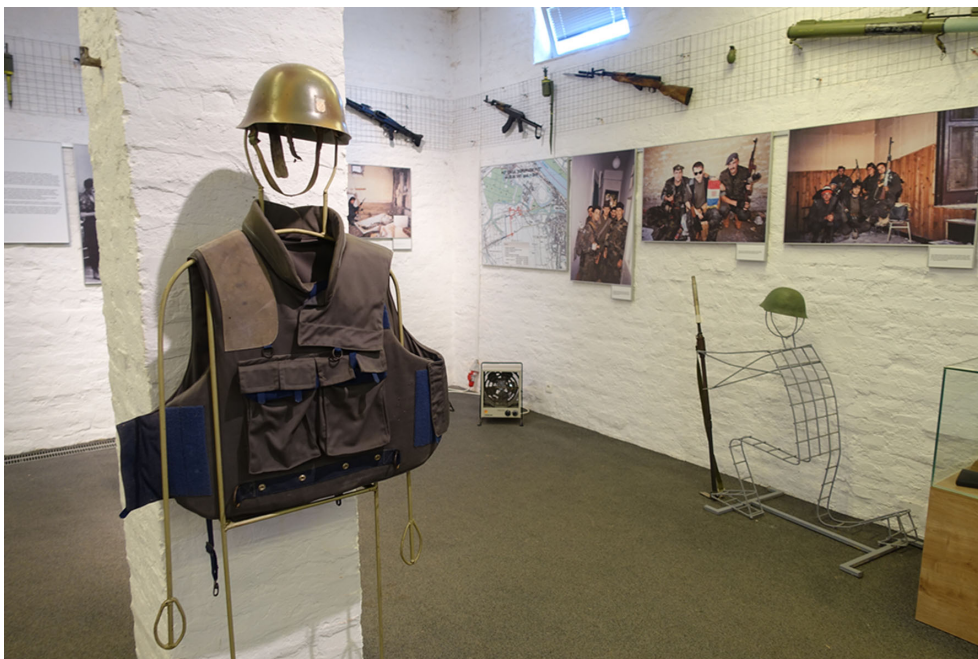
Figure 5. At the Memorial Center for the Homeland War in Vukovar, © Author.

honor the efforts of medical personnel and workers in factories, schools, community offices, churches, humanitarian help, and the inhabitants “who formed an unbreakable unit with the defenders.” Most of the other texts are either part of a chronology of the fighting or introduce different military units.