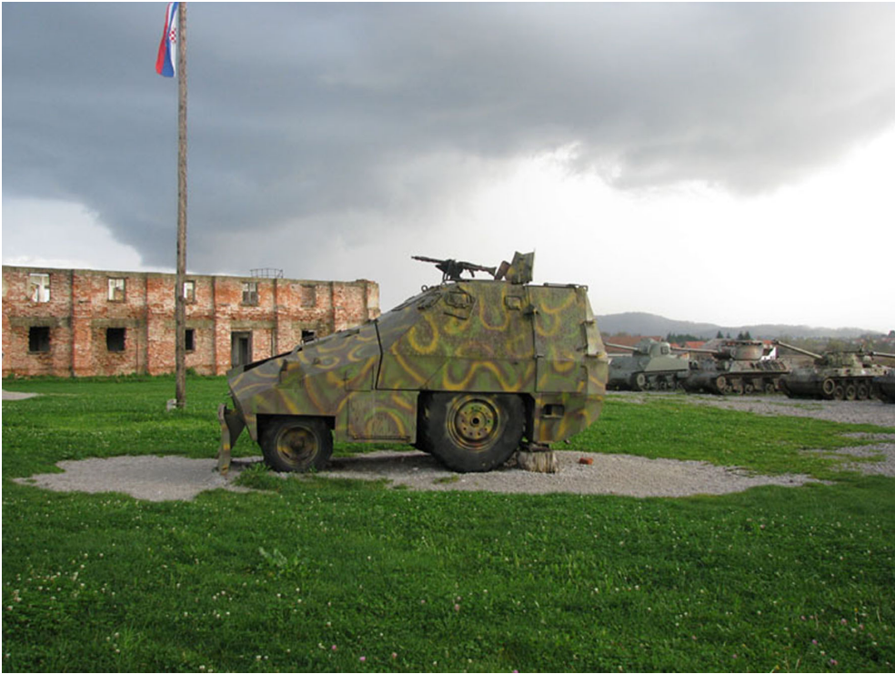
Figure 1. Outdoor exhibition in front of the ruin which later became the museum.