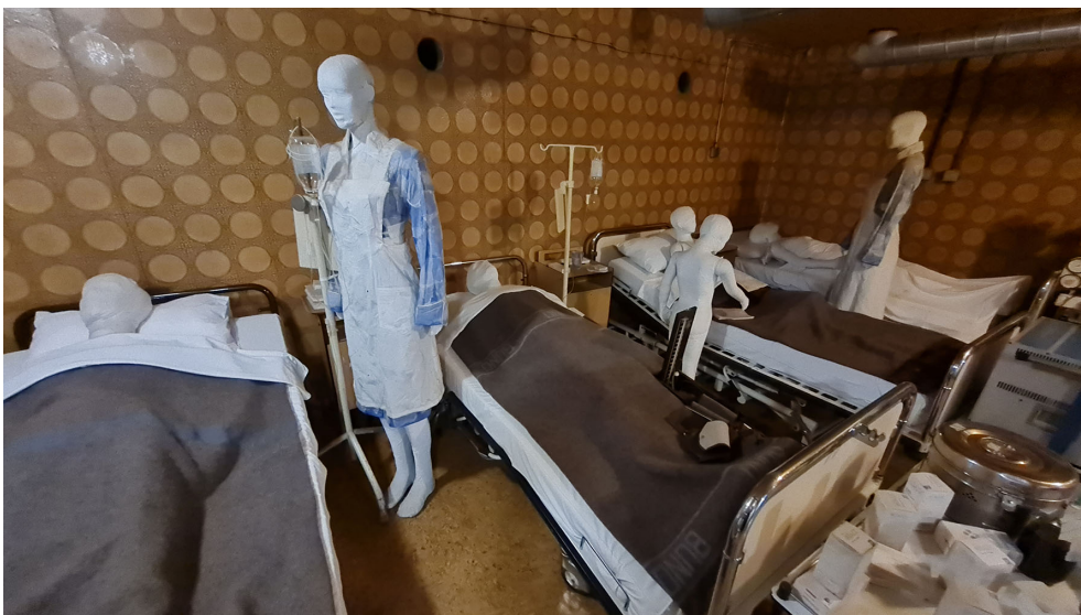
Figure 7. The Memorial Hospital in Vukovar