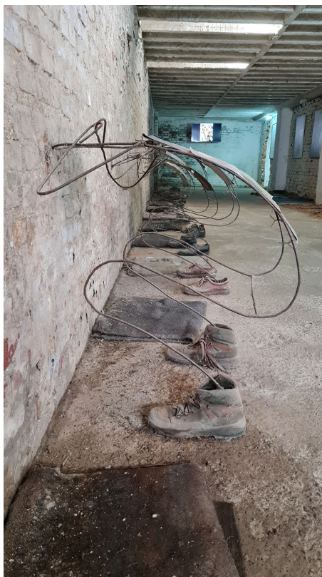
Figure 6. Exhibition of “Serb concentration camps,” © Author.

military equipment and toward the display of stories concerning the cultural impacts of war. War toys have become much more closely related to the fate of civilians. (Jaeger 2020, 1)