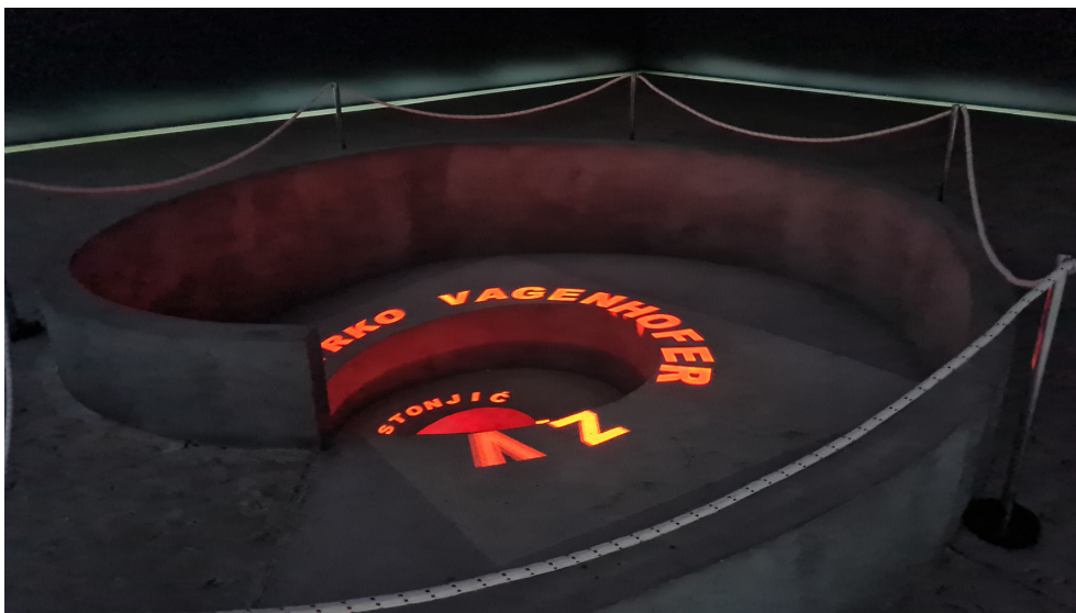
Figure 8. Victims' names spiraling into a vortex at Ovčara, © Author.

murder. Moreover, the individual victims' belongings are exhibited under a typical glass floor – mixing objects found during the exhumations with others donated by relatives. While the publication and the name of the Association carrying the term “concentration camp” in it would make one expect a drastic depiction, the Memorial Home makes a different kind of reference to international icons: by implementing an empathy-evoking focus on the individual victim. Also, while the Memorial Center, today in charge of the site, calls Ovčara a “concentration camp” on the English version of its website, the almost identical text on the computer screen at the site uses the word “prison camp.” In contrast, the Croatian version in all cases uses the term “camp,” so the English “concentration camp” communicates how bad the Serbs were to a potentially less informed foreign audience.