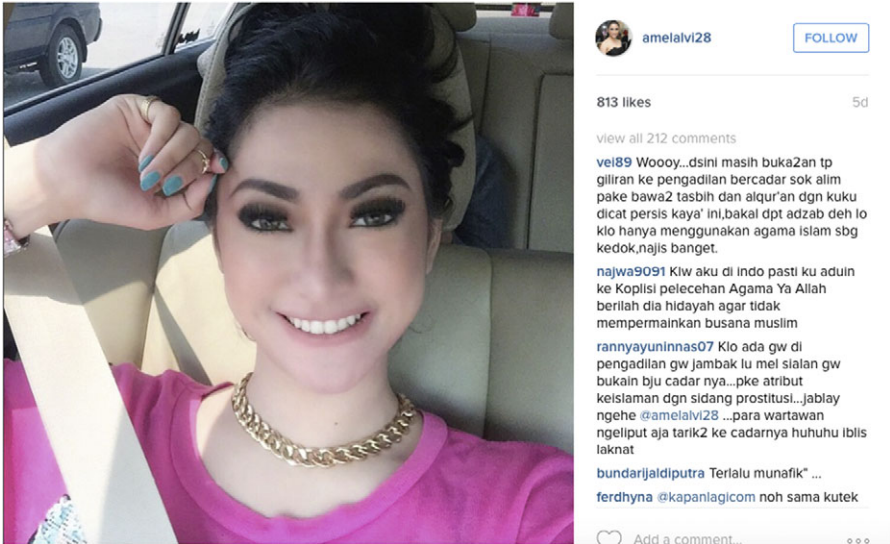
Figure 3. Celebrity entertainer Amel Alvi in selfie taken the evening before her trial, 30 September 2015; @amelalvi28.