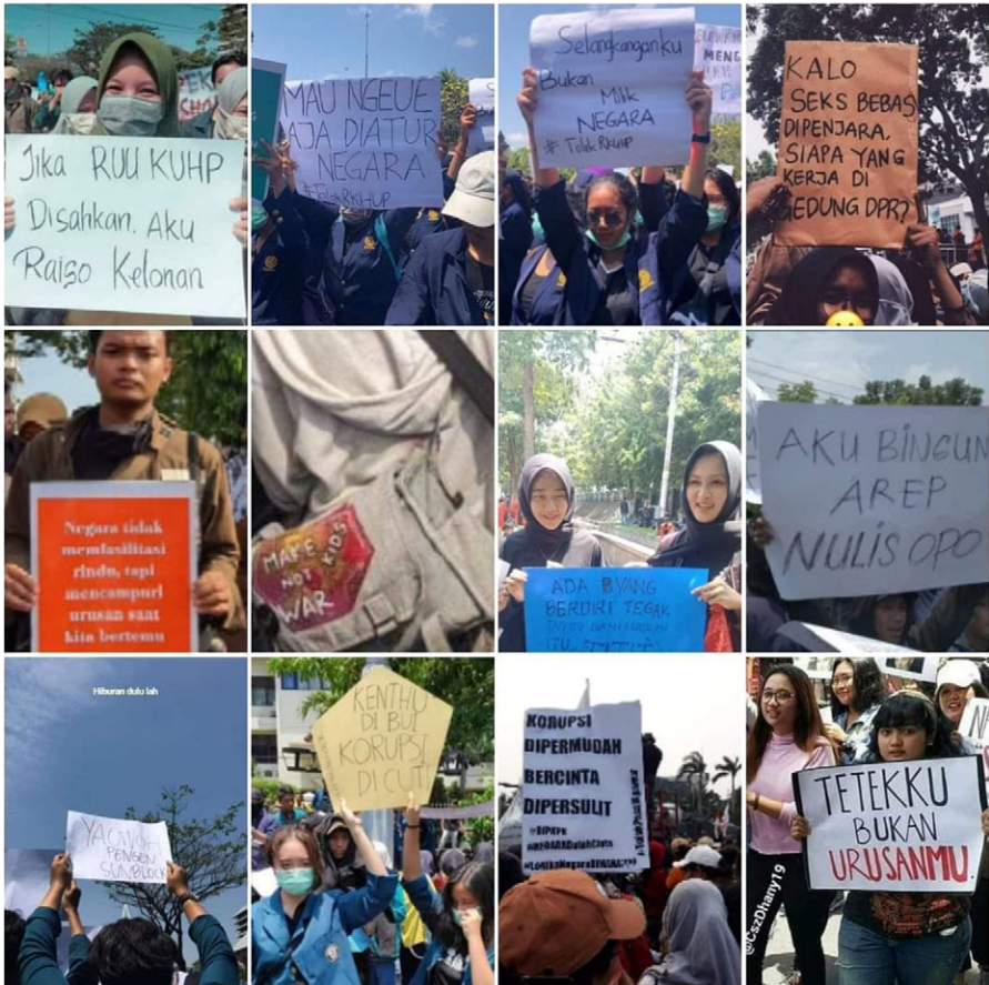
Figure 9. Collage of protesters' signs that circulated widely via WhatsApp in September and October of 2019.

Over six days of coordinated protests across the country, from 24–30 September (the last week of the parliamentary session), students tied their resistance, their demands, and their humor to the laws as a pair. By highlighting the hypocrisy of making private sexual life subject to state surveillance while making theft of public goods potentially more private and safer, protesters' aesthetics included consistent themes in their posters and dress styles. Their posters pointedly asked, "If extramarital sex results in imprisonment, who will be left to serve in the legislature?" "Making corruption easier while making love harder." "Sex gets you jailed. Corruption just gets you a vacation," and "Brokenhearted but still protesting." Many of the same phrases appeared at multiple protest sites, conveying the coordinated, viral strategy of what was also a national resistance movement known as Aliansi Rakyat Bergerak (People's Movement Alliance), (see figure 9).