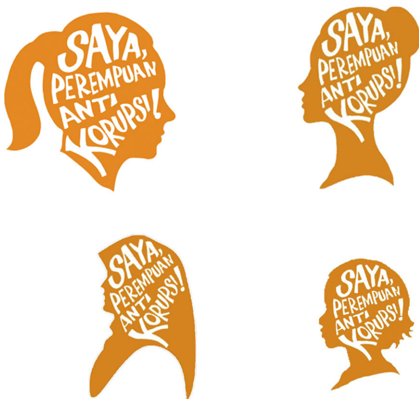
Figure 11. A selection of profiles of women's heads in profile designed to invite everyday Indonesian women to recognize themselves as participants in efforts to fight corruption. At http://www.spakindonesia.org (accessed 3 July 2022, but it is no longer online).