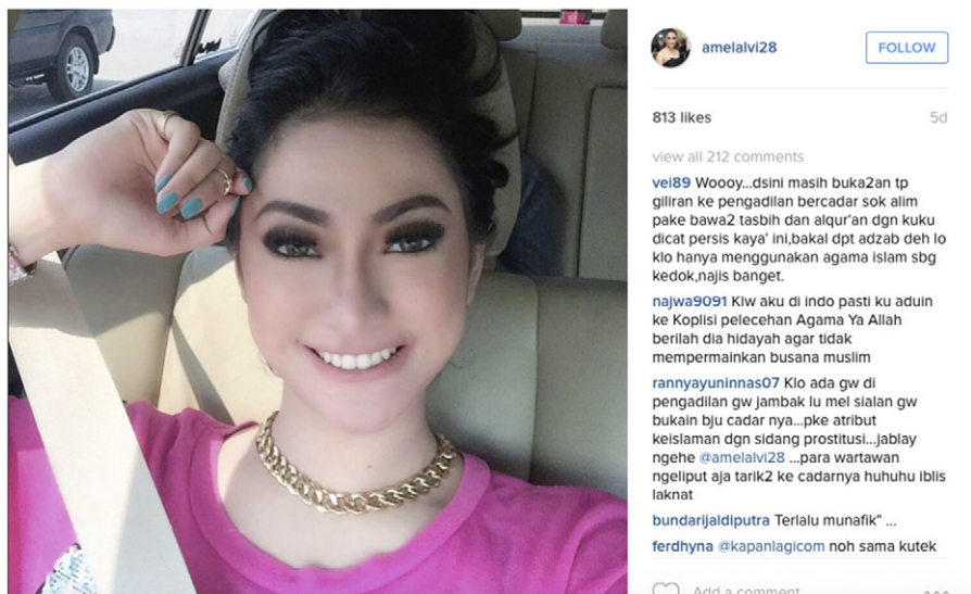
Figure 3. Celebrity entertainer Amel Alvi in selfie taken the evening before her trial, 30 September 2015; @amelalvi28.