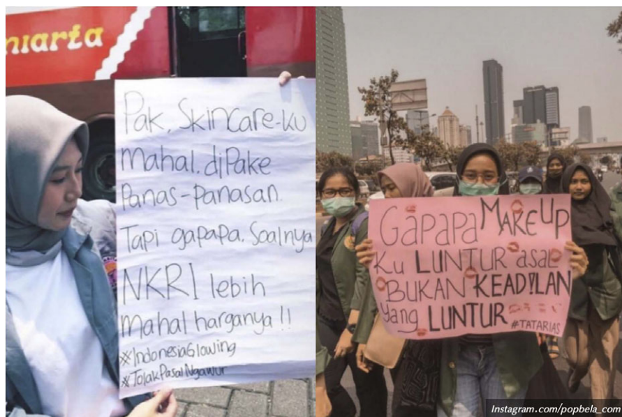
Figure 10. Collages of young women that circulated with versions of the phrase, "Mister, my skincare is expensive. Wearing it just makes me hotter. But I don't mind because NKRI is even more valuable"; or "I don't mind if my makeup wears off, as long justice never wears off," September 2019; @popbela.