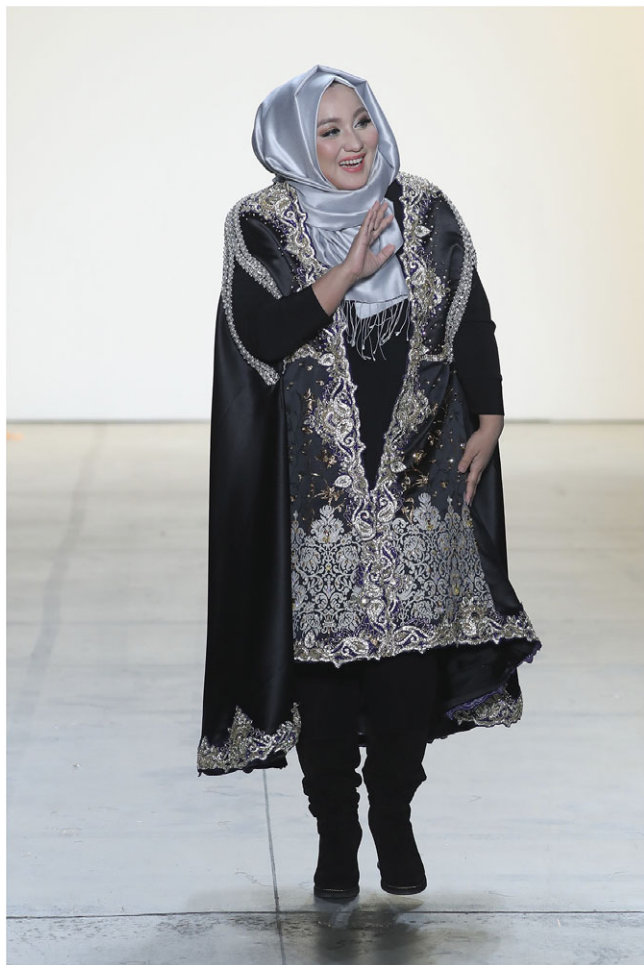
Figure 1. Anniesa Hasibuan walking the runway at the end of her 14 February 2017 fashion show at New York Fashion Week.