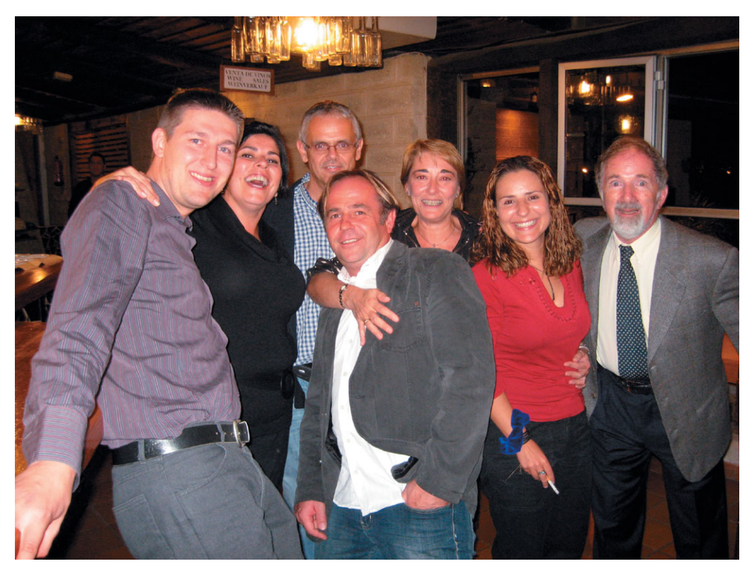
A happy LOC at the banquet