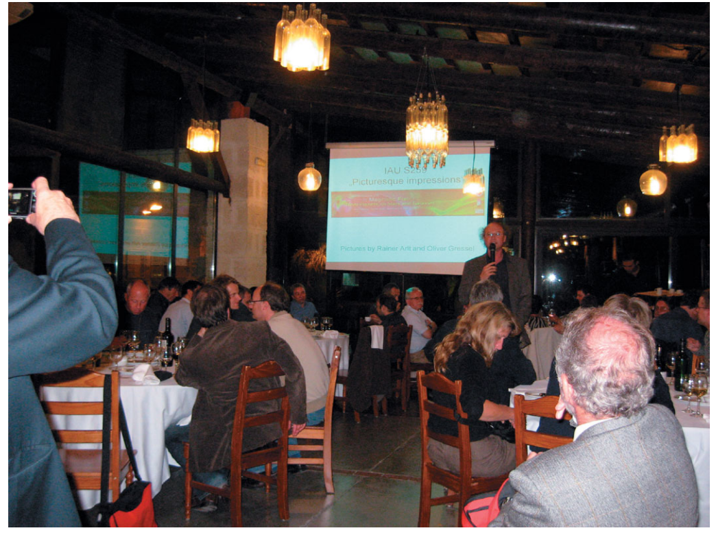
During the banquet late-night slide show