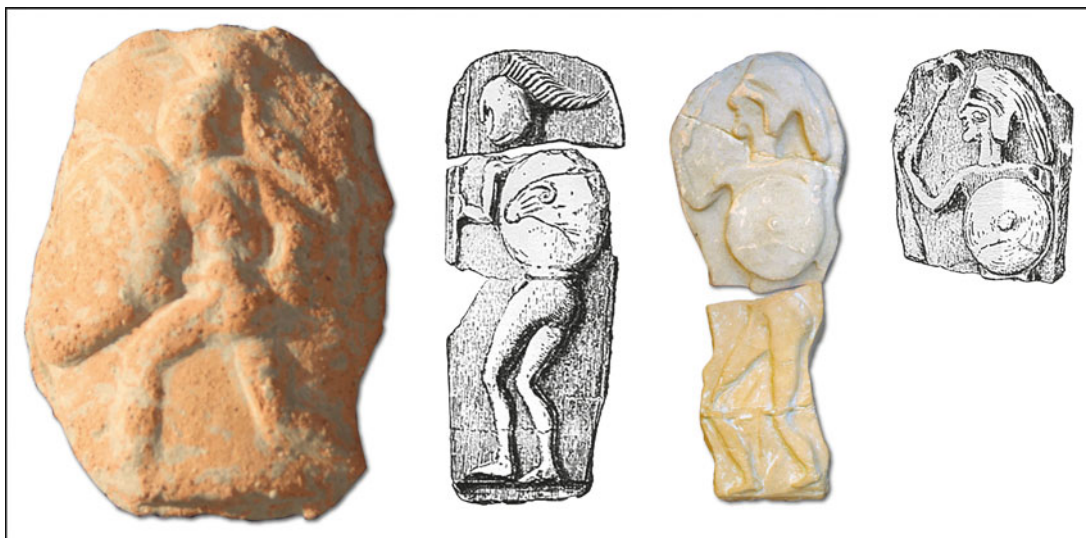
Fig. 3. Sequence of terracotta 'warrior' plaques from the sanctuary of Vavelloi and from trenches below the Almond Tree House (both at Praisos). After Whitley 2016, 259, fig. 2. Prepared by Kirsty Harding.

distinctly masculine iconography, that of a 'warrior abducting a youth'. 55 The masculine terracotta plaques from Vavelloi itself show the greatest degree of iconographic continuity, which can be traced over four centuries in two distinct images. The first is that of a (nude) male with hand on hip, 56 the second of 'warriors' with plumed helmets and shields facing left (Fig. 3). 57 It is not too much, I think, to suggest that all these plaques may have been related to a kind of initiation ceremony for young men – a process by which they became citizens and warriors through a ritual not dissimilar from the famous account of Ephorus/Strabo (Strabo 10.4.20-1; Ephorus, FGrHist 70 F 149). 58