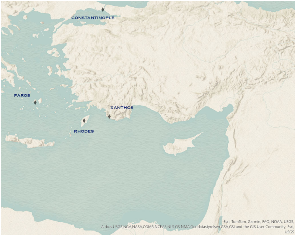
Fig 1. Mediterranean and Aegean. Working at Xanthos, the closest British consul was on Rhodes. Map: by the author.

bring attention to some of the vital contributions made to the development of archaeology by people of professions that posterity has seldom associated with intellectual pursuits. Before embarking on the narrative of the first Xanthos expedition through previously unexamined archival material, this paper will address the imperial context necessarily bound up in a government-backed expedition and consider where the Xanthos expeditions fit into nineteenth-century archaeology.