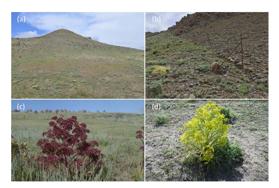
PLATE 1 (a) The remaining population and habitat of Ferula sinkiangensis in Yining County, Xinjiang, China, (b) the effects of grazing, (c) the fruiting stage and (d) the flowering state. (a), (b) and (d) photographed in 2023, (c) in 2018.

resulting in the destruction and loss of the species' habitat (Li et al., 2016). Additionally, extensive grazing around the F. sinkiangensis reserve constrains its growth, as any plants that grow outside the reserve are consumed by cattle and sheep, preventing the population from expanding (Plate 1). Furthermore, despite legal prohibitions against harvesting F. sinkiangensis, this still occurs, threatening the species' survival. Because of its narrow distribution range and decreasing number of individuals, F. sinkiangensis is categorized as Critically Endangered on the Threatened Species List of China's Higher Plants based on criterion A2c (Qin et al., 2017). We propose that the species should be categorized as Critically Endangered on the IUCN Red List based on criterion B2ab(iii), C2a(i) and D (IUCN, 2022); i.e. we calculate the area of occupancy to be the same as the extent of occurrence at 4 km<sup>2</sup> (B<sub>2</sub>), there is a single location (a), which is affected by cattle and sheep grazing, and human disturbance, resulting in a continuing decline in extent and quality of habitat (b(iii)), and the results of the surveys conducted in both years show that there are fewer than 50 mature individuals within each subpopulation (C2a(i)) and the whole population (D). The area occupied by the two subpopulations falls within a single cell of a 2 × 2 km grid, and therefore both the extent of occurrence and area of occupancy are < 4 \text{ km}^2 .