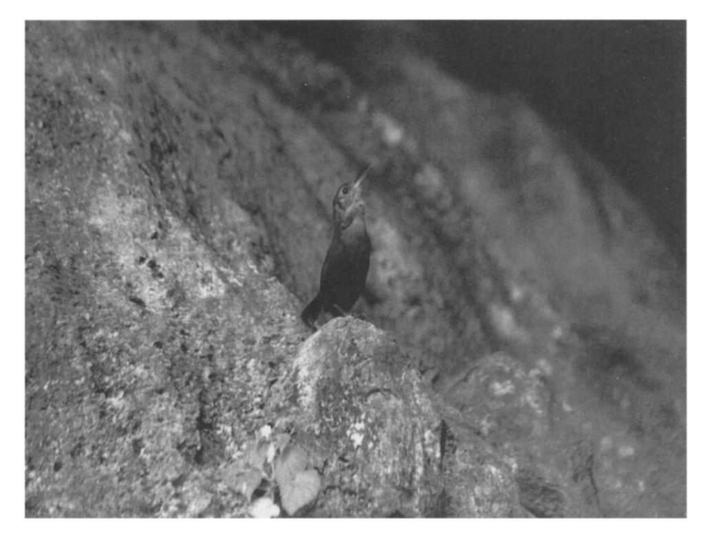
Figure 2. Male Sumichrast's Wren singing at the mouth of a limestone cave in Cerro de Oro (locality 2-6). (Photographed by Mónica Pérez Villafaña, August 1994.)