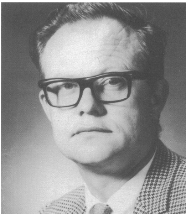
Figure 21: Vern L. Bullough (photograph taken about 1966).

Bullough was not the first scholar to associate the formation of a medical profession with the medieval medical schools. In standard histories of medicine such as P. V. Renouard's in the nineteenth century, this point had been made in very general terms. What Bullough did that was different was to use the sociology of professions of his day to show convincingly how and why, in the thirteenth and fourteenth centuries, medicine changed decisively and relatively suddenly to become a profession that people of the twentieth century recognized as somehow modern—"professional recognition in the sense that the term is now used", as Bullough put it. 15