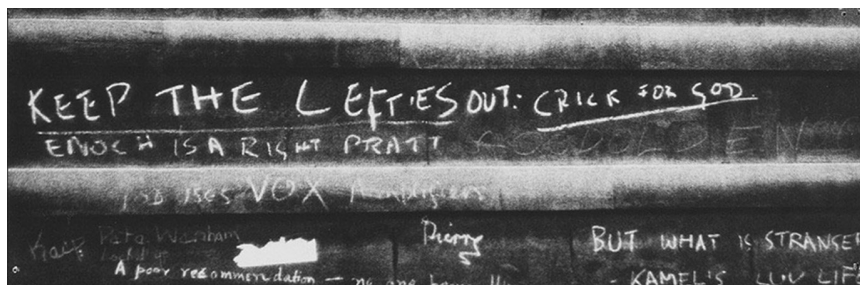
Figure 4: Crick wall-graffiti. Location and date not indicated (PP/CRI/A/1/2/8).

God—took the form of wall-graffiti: “CRICK FOR GOD”. It is recorded in a sepia photograph in the archive (Figure 4), in which Crick jostles for wall-space (perhaps in Cambridge) with the British Conservative Party politician “ENOCH” [Powell] and “THE LEFTIES”. 25