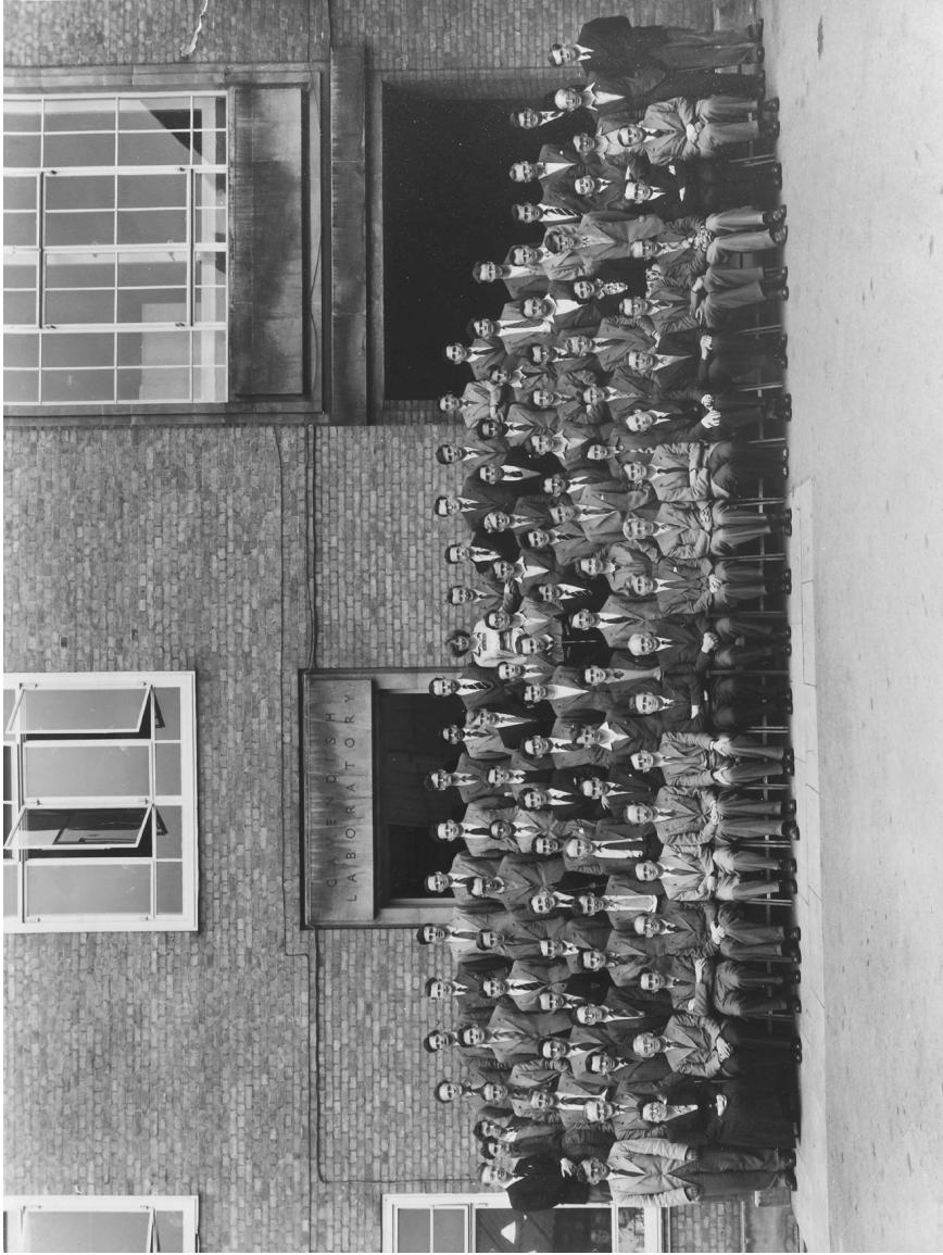
Figure 1: Physics research students, Cavendish Laboratory, Cambridge (June 1952). James Watson and Francis Crick are in the first row standing, sixth and seventh from the left, respectively (PP/CRI/A/1/2/1).