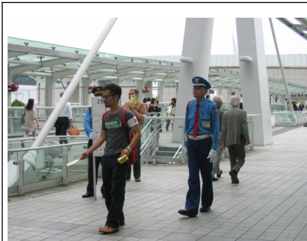
Shutoken Seinen union members appeal to Nissan stockholders over the company's employment practices, Yokohama, June 2009

Shutoken Seinen is among the most active of the new unions and well illustrates their mode of operation. We met some of its members in Yokohama at a time when Nissan was holding its 2009 stockholders general meeting. Five of them sought to raise their grievances with Nissan shareholders on their way to the conference center. They sought to draw attention to the case of a young woman, hired by Nissan under a short-term labor contract three years previously, and then repeatedly renewed before being suddenly dismissed. The case exemplifies attempts by many companies to prevent workers from achieving the status and benefits of permanent employees.