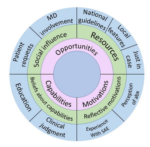
Fig. 2. Behavior change wheel.

Note. SD, standard deviation; VAMC, Veterans' Affairs medical center. <sup>a</sup>As dentists reported 'all that apply' for race/ethnicity, percentages may not equal 100% when summed. Additionally, 2 participants declined to answer this question.