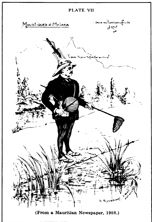
(From a Mauritian Newspaper, 1908.)

Order from: British Medical Journal (Keynes Press) PO Box 295, London WC1H 9TE