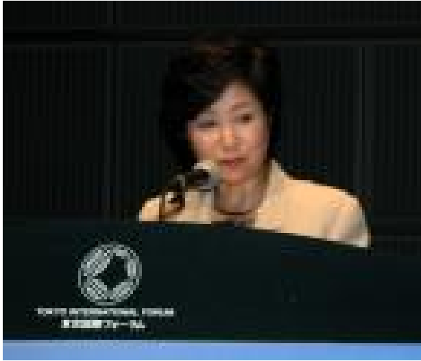
Environment Minister Koike Yuriko

Even the chairman of Chisso was present. For the past half-century, Japan's, and the world's, environmentalists have cursed the name of Chisso. This is the company that caused Minamata Disease by dumping organic mercury into the bay, and then denying responsibility when the first victims appeared. This is the company that twisted the arms of the first impoverished victims back in 1959, forcing them to sign an agreement saying they would not sue Chisso even if in the future the company was found to be the cause. In return, they got payments of between 30,000 and 300,000 yen, minuscule sums, yet more money than most had ever seen.