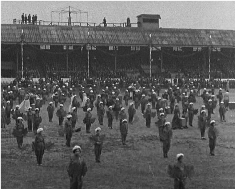
Figure 1: Children dressed as buds of cotton during the opening scene of the Lancashire Cotton Pageant 1932. British Pathé, Film ID: 679.12.

performers, commemorating the centenary of the opening of the Liverpool and Manchester Railway. 77 In 1932, Anderson hit the ‘big-time’ with the Lancashire Cotton Pageant, and truly began using pageantry to put the ideals of civic publicity into practice. 78 Performed 16 times in Manchester’s Belle Vue gardens, the pageant had a cast of 12,000, and attracted crowds totalling 200,000. The pageant was organized by the Joint Committee of Cotton Trades’ Organizations, the Lancashire Industrial Development Council and the Manchester Development Committee, and was also supported by mayors and councillors from surrounding towns and cities, such as Liverpool, Stockport and Oldham. 79 The narrative created a both allegorical (see Figure 1 ) and literal story of cotton, with scenes such as Cotton in Ancient Times, The Age of Inventions (featuring inventors such as John Kay, with his flying-shuttle) and Lancashire at Work (depicting the working-life of the mill operative). 80