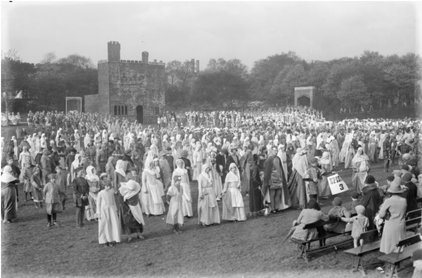
Figure 4: The performers and audience of the Stoke-on-Trent Historical Pageant (1930).