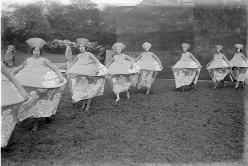
Figure 3: Women dressed as pottery during the Stoke-on-Trent Historical Pageant (1930).