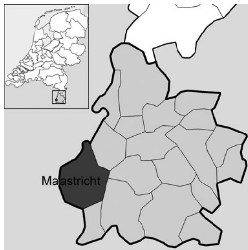
Fig. 1. Map of South Limburg region with the municipality of Maastricht highlighted.

The samples for 1987 were available from the biobank of the Monitoring Project on Cardiovascular Risk