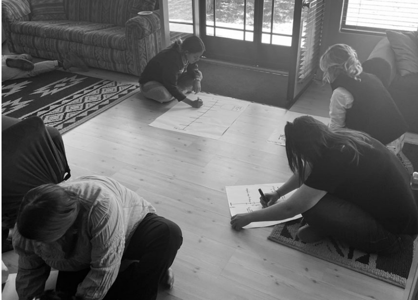
Photo 1. University workshop group creating environmental identity timelines.