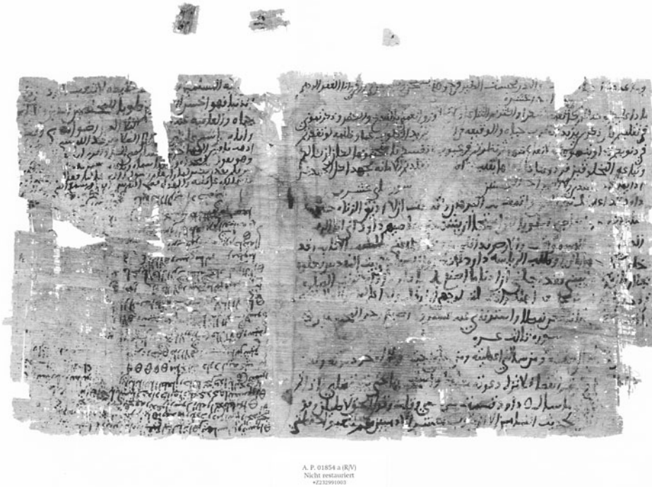
Figure 4. P.Vindob. AP 1854a image 1 = fols 6a (left) and 5b (right) (inside of Q3, verso, horizontal fibres).