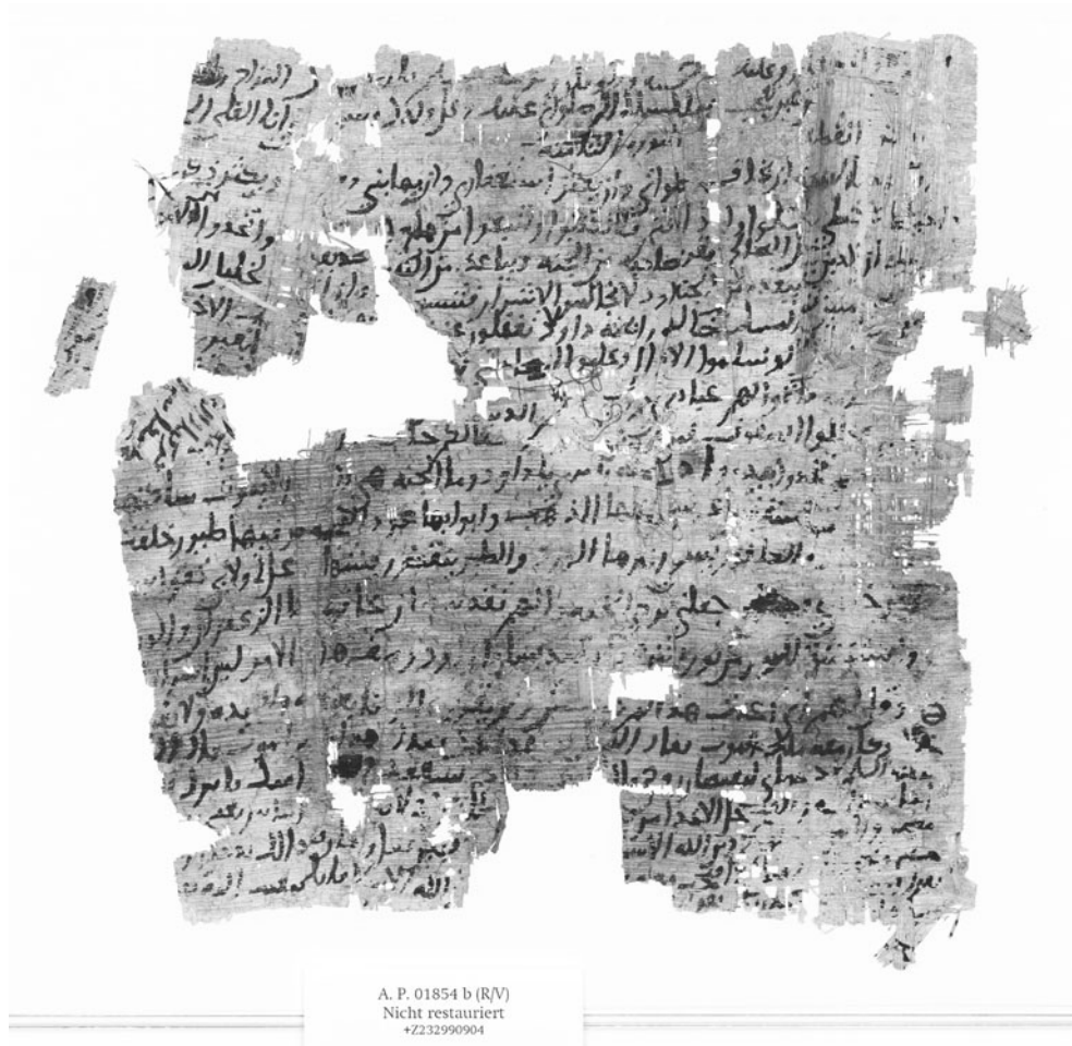
Figure 1. P.Vindob. AP 1854b image 1 = fol. 4a (inside of Q2, verso, horizontal fibres, with flap of 3a folded over upper right corner).

Determination of the relationship between the two leaves is complicated by the fact that the four texts are not written sequentially, but are broken into sections that are