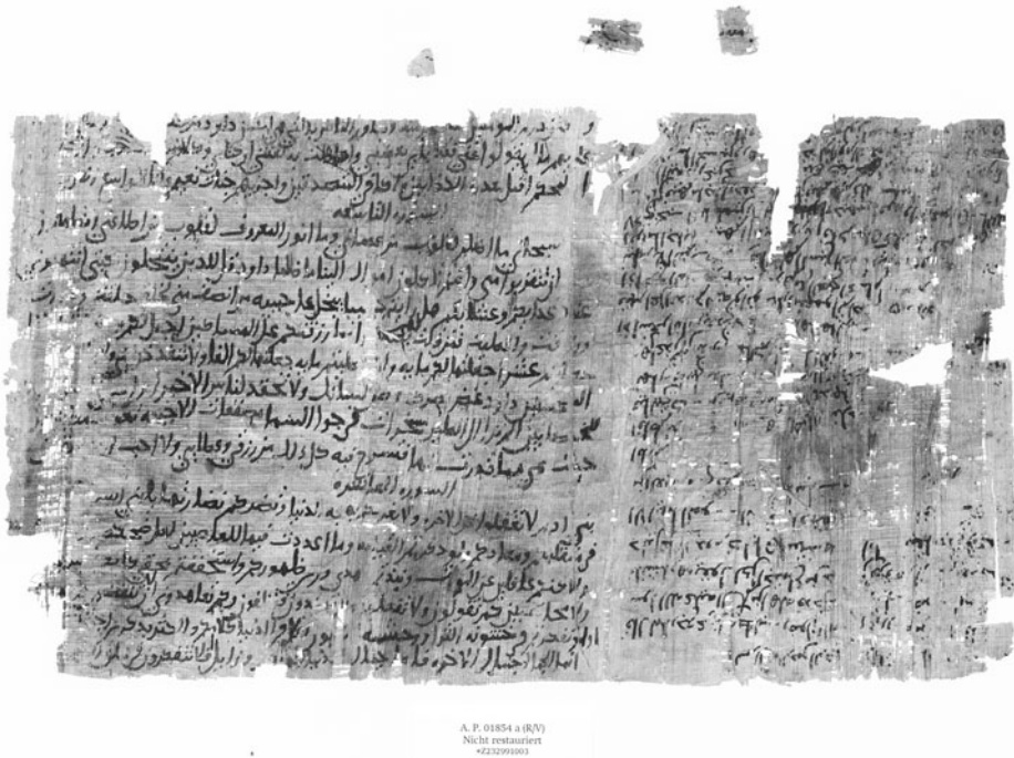
Figure 3. P.Vindob. AP 1854a image 2 = fols 5a (left) and b6 (right) (outside of Q3, recto, vertical fibres).

have fit perfectly on folios 1–3, and indeed the few words that are visible on the flap of folio 3 that is folded over the upper right corner of folio 4a are from the beginning of psalm 5, which is precisely what one would expect to find near the top of folio 3a. That these bifolios were sewn together seems likely given the two pairs of holes that straddle the inner margin or gutter of Q3; a third pair of holes would have been in a damaged portion. The inner margin of Q2 is partly missing and too damaged for us to be sure of whether or not it had similar pairs of holes.