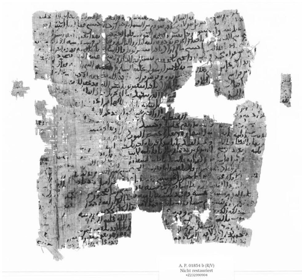
Figure 2. P.Vindob. AP 1854b image 2 = fol. 4b (outside of Q2, recto, vertical fibres).

interspersed with each other, and also by the fact that most of folio 6a and all of folio 6b are written upside down relative to the rest of the papyrus. The jumbled state of the text suggests that it was produced as a notebook for personal use rather than for written distribution—as was the case with most religious writing in the eighth century, according to Gregor Schoeler, who calls such private notebooks and mnemonic aids for lecturing ‘ hypomnēmata ’. 47 We believe that the two leaves were part of a small notebook that consisted of three bifolios that were not nested, but sewn together sequentially, as three singletons (quires consisting of one bifolio each), as illustrated in Figure 5. 48