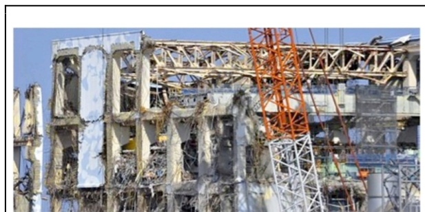
Reactor # 4 at Fukushima Daiichi

Cesium-137 at the Fukushima Daiichi site is 85 times greater than at Chernobyl.