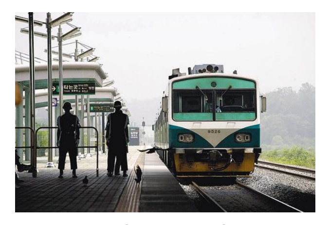
A train at Imjingak Station near the DMZ

"The North Korean side said in a telegram that it is no longer able to conduct the railway tests as scheduled because of the lack of a military agreement to guarantee the safety (of people taking part) in the trial runs and unstable conditions in the South," Shin told the news briefing.