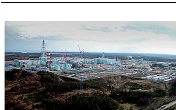
Aerial view of Rokkasho plant in Aomori

Prof. von Hippel started his presentation by describing the IPFM 4 and its work. The IPFM was established in 2006 as an independent body dedicated to arms control and nonproliferation. It focuses on the management of nuclear materials. Two types of material pose a particular problem, plutonium and highly enriched uranium. There are 500,000 kilograms of plutonium in existence globally, which is enough for approximately 100,000 nuclear weapons. Half of this was produced during the Cold War in weapons programs, whereas the other half was produced for civilian use in reactors. Civilian-use plutonium was produced in the belief that uranium 235 was scarce and so there was a pressing need to build new reactors that would use uranium more efficiently. These new reactors were the plutonium breeder reactors. About 1% of the