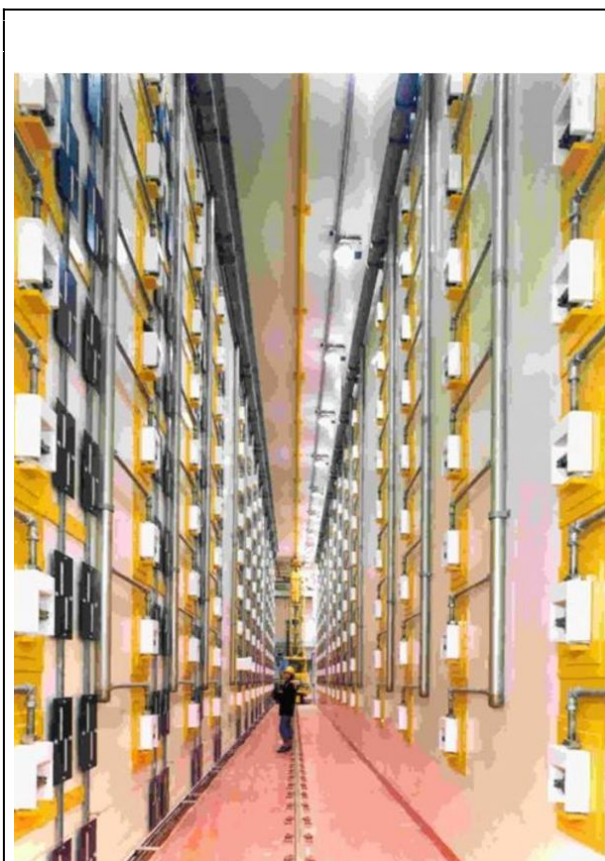
Plutonium storage area, Sellafield, England

Japan possesses around 40 tons of plutonium, which is enough to make five thousand nuclear warheads. Most of this plutonium is stored in France and Britain. 5