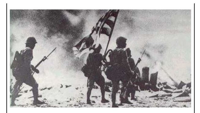
Japanese military attack Rabaul, 1942

In early 1942, the Japanese military, having disposed of the British in Malaya and Singapore, took over the Dutch East Indies in a few weeks.