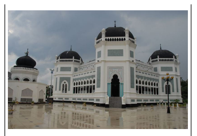
Great Mosque, Medan

Where such landowners were respected ulamas and rich hajis, resistance was often couched in terms of religion versus atheism. Many of them shrewdly donated surplus hectares to mosques as unalienable wakaf property, and sat on the boards administering these gifts. Now religious, no longer personal private properties they were difficult for the PKI to attack, since even poor and land hungry Muslims would come militantly to their mosques' defence. Generally speaking, the collapse of the currency helped to create a pervasive atmosphere of fear, uncertainty and anger. These tendencies help to explain why the largest and worst massacres took place in the country's villages, where land was most seriously contested and the big-party mass organizations were most active.