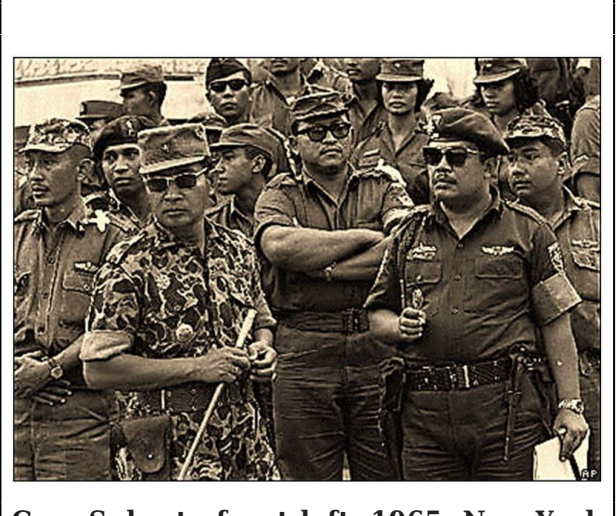
Gen. Suharto front left, 1965.

commander of the army's elite Strategic Forces, who, curiously enough, was not a target of the Movement. By midnight, the mutiny had been crushed, and its leaders scattered and on the hopeless run. The capital's newspapers, except those of the military, were closed down the next morning, and national TV, along with national radio, fell into Suharto's hands.