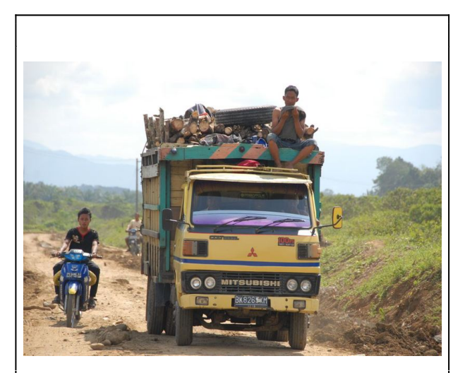
Rural Medan today

mostly civil servants, tried to maintain their standards of living by corruption, embezzlement, and investing in farm land. This last not only put pressure on land-hungry small farmers, tenants, and rural labourers, but clashed with the PKI's attempts to enforce a weak land reform law, fiercely resisted by landowners old and new.