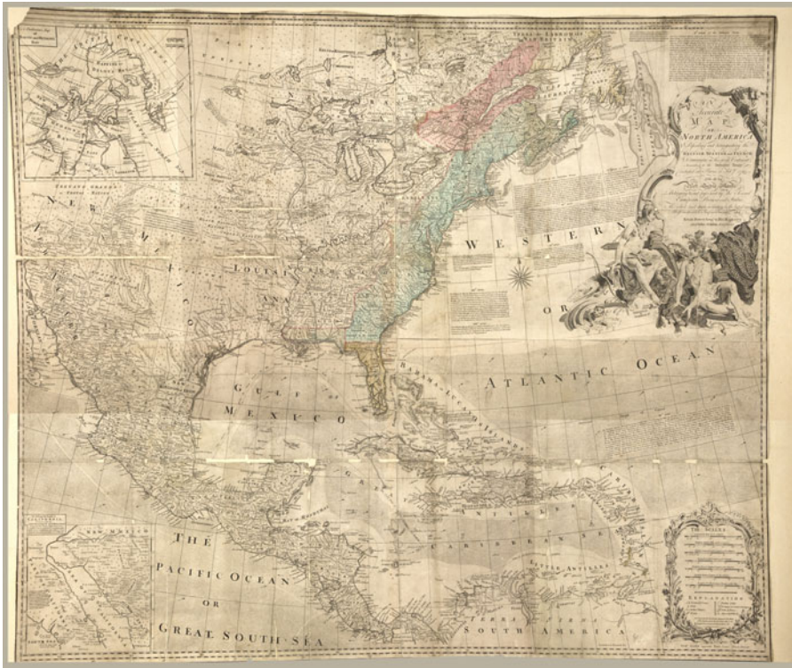
Figure 2. Revised map by the Board of Trade, 1763.

Reflecting the beliefs circulating at court, the Board believed that the various “interests” in North America could balance and correct each other. While still in the dark about Indigenous uprisings and resistance in May 1763, the Board nonetheless worried about settler expansion into the interior as “a manifest Breach of our general Engagements with the Indians which would naturally excite them in a Jealousy and Disquiet that might prove of fatal Consequence,” citing earlier reports from colonial correspondence as well as the specific stipulations of the Treaties of Easton, Lancaster, and Detroit, “which Reports Treaties & Representations have already been laid before Your Majesty.” 72 To solve all the problems at once, the Board proposed what they called “an exact Union of System.” This system became the Proclamation of 1763 four months later: a boundary running along the sources of all rivers that ran directly into the Atlantic and Gulf of Mexico, with interior territory “considered as Lands belonging to the Indians, the Dominion of which to be protected for them by Forts and military Establishments ... and with full Liberty to all Your Majesty’s Subjects in general to trade with the said Indians.” 73