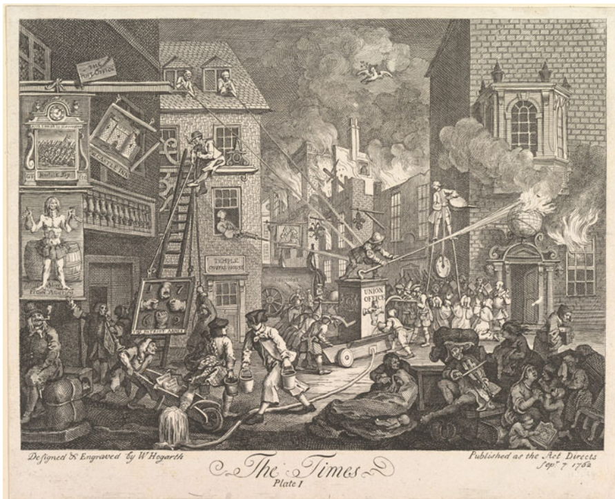
Figure 1. Hogarth, “The Times,” 1762.

Shelburne promised prosperity. British manufacturers would reap the benefits of “clothing” Indigenous Americans and turning the settler colonies’ “Rice, Tobacco, Corn, & Fish” into foreign exports for the European market. The colonies as they grew would “increase population & of course the consumption of our manufactures, pay us for them by their Trade with Foreigners, & thereby giving employment to M[illio]ns of Inhabitants in G. Britain & Ireland.” These developments, Shelburne concluded, were “of the utmost consequence to the Wealth & Safety & Independence of these kingdoms and must continue so for ages to come.” 52 Shelburne’s revived mercantilism fitted well with the ministry’s ongoing efforts to revise and support a more aggressive approach from the East India Company in the same years. 53