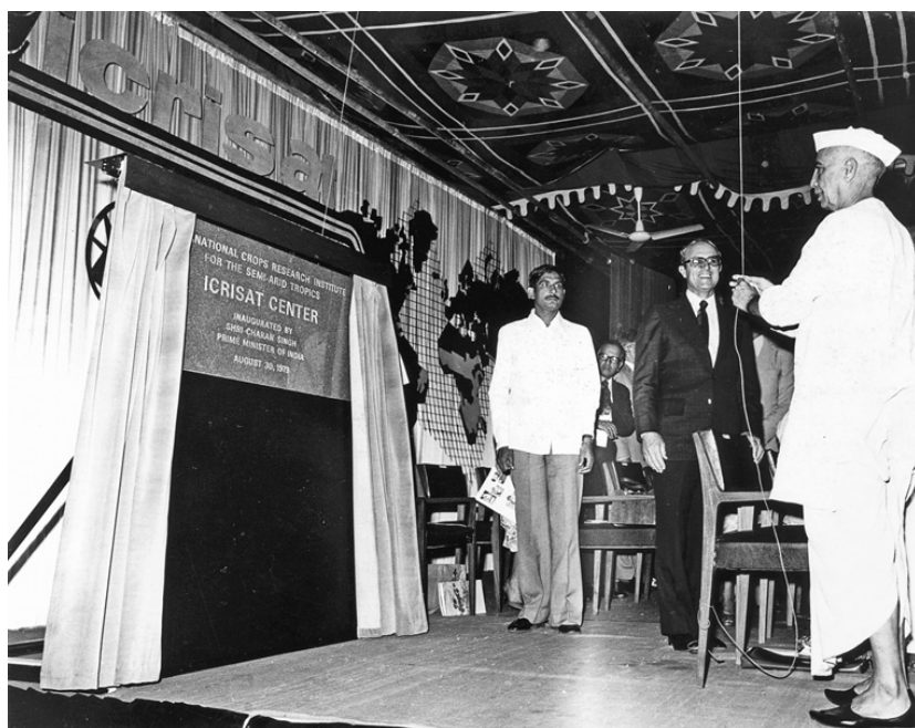
Figure 2.2 Prime Minister Charan Singh at the dedication of ICRISAT in 1979.

in which small farmers in rainfed areas had to be pulled up economically. He mentioned the dependence of 70 percent of the country's agriculture on uncertain rains and thus underlined the importance of ICRISAT in addressing this vast geography and "helping the farmers who are dependent solely on rainfall." Meanwhile the chief minister, Reddy, thanked ICRISAT for choosing his state as its location. An element of regional pride suffused Reddy's adulation as he emphasized the importance of Andhra Pradesh in Indian agriculture. 40 In short, a tenuous alliance seemed to exist over ICRISAT. This secured its place as an Indian, as well as an international, institution.