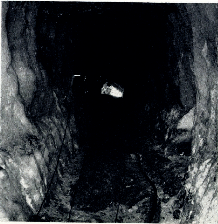
Fig. 3. Several fluted moraine ridges were observed in the whole length of the tunnel. Two of them terminated, or rather started, in the tunnel and in both cases they started on the leeward side of a well-polished boulder. Their cross-sections conformed to those of the boulders