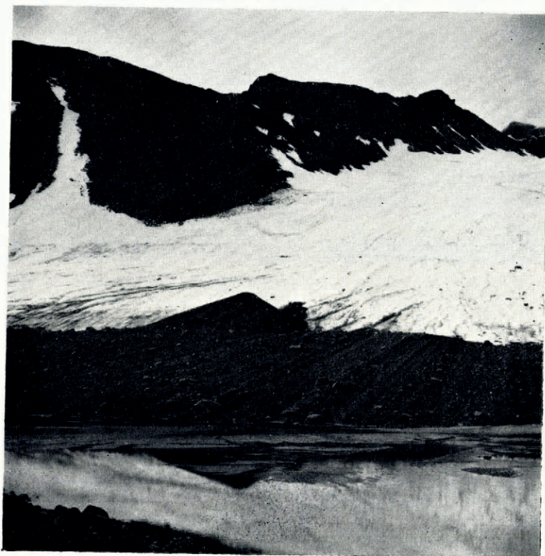
Fig. 1. Fluted moraine surface in front of Isfallsglaciären, Kebnekajse, Swedish Lapland

"All observations indicate that fluted moraine is an accumulation phenomenon but not related to