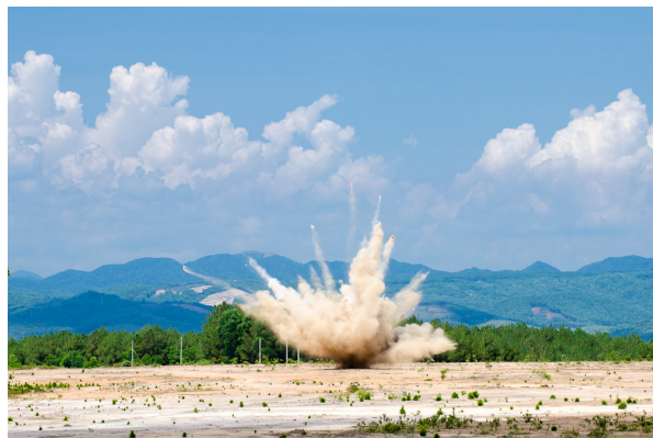
Quang Tri Province, Vietnam, 2013 - A controlled demolition conducted by an Explosive Ordnance Disposal team from Project RENEW.

Ending a war is like stopping a heavy truck. Even when you slam on the brakes, the mass and inertia of the conflict takes a very long time to halt; the violence might end but the effects can reverberate through decades and generations. German units still find and defuse bombs in Germany dropped during World War II; 1 French deminers regularly collect and destroy artillery shells on the Western Front from World War I, over a hundred years ago. 2 During the active phase of a war, many of the shells and bombs hurled by armies on both sides fail to explode upon impact; many land mines are never tripped. Later they are forgotten in the forests or jungles, covered by vegetation or shifting soil, washed away by rain