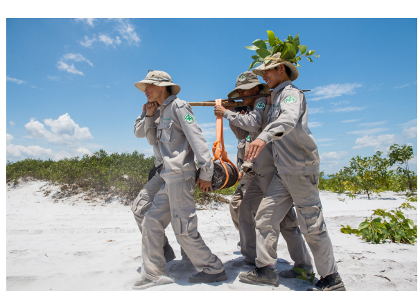
Thua Thien Hue Province, Vietnam, 2014 - Members of an EOD team carry away a large artillery shell discovered in a remote area in the province. It will be detonated later at a site used for safe disposal of ordnance.

NPA is one of the major organizations in the world clearing mines and UXOs, but it is different from many other demining groups. Private corporations, staffed by military veterans, are often hired by countries or big property owners to parachute in, clean up a town or plantation and move on to the next job. Some NGOs bring in experts who complete the work but then depart, leaving the local community unprepared to tackle the ongoing problem themselves. Military veterans from the U.S. and other western countries who have EOD (Explosive Ordnance Disposal) experience generally prefer to work for those organizations because they pay so much better than NPA.