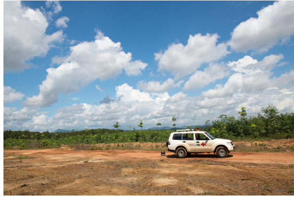
Quang Tri Province, Vietnam, 2013 - One of Project RENEW's ambulances. All field teams of Project RENEW and NPA are accompanied by a medic and an ambulance.