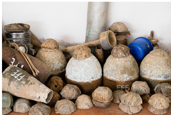
Sekong, Lao PDR, 2014 - Behind its regional headquarters in Sekong, NPA keeps a number of cluster bomb units (also known as "bombis") discovered and rendered safe by deminers.

Over the last five years, I've been travelling to different countries to photograph the work of two non-governmental organizations (NGOs), Project RENEW ("Restoring the Environment and Neutralizing the Effects of the War") and Norwegian People's Aid (NPA), that specialize in reclaiming land from actual or potential destruction by mines, bombs and mortar rounds and artillery shells. Much of my time was spent in Vietnam, Cambodia and Laos in 2014, hiking with teams of deminers through jungle, up hills, across old plantations, and rattling around in Land Cruisers down atrocious roads. In preparing this piece for publication, I contacted the program managers for the three countries and the headquarters of NPA's Humanitarian Disarmament Division based in Oslo to update my notes. What follows is a report, mostly in images, of the local people across Indochina that do the hard, sometimes dangerous work of reclaiming their countries.