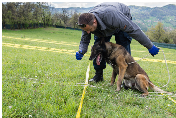
Vogosca, Bosnia and Herzegovina, 2014 - a trainer puts one of the Belgian Shepherd Malinois through its paces in a field at NPA's Global Training Center, just outside Sarajevo.

over the target. The dogs work far faster than humans with a metal detector, and with much greater accuracy. Although the dogs are used all over the world, they are trained to understand and obey commands in the Norwegian language. Currently NPA operates dogs in six countries, including Cambodia. NPA started training its own dogs at the GTC in 1999 and has never had a dog-related accident. (NPA also trains dogs for the Norwegian and Bosnian armies.)