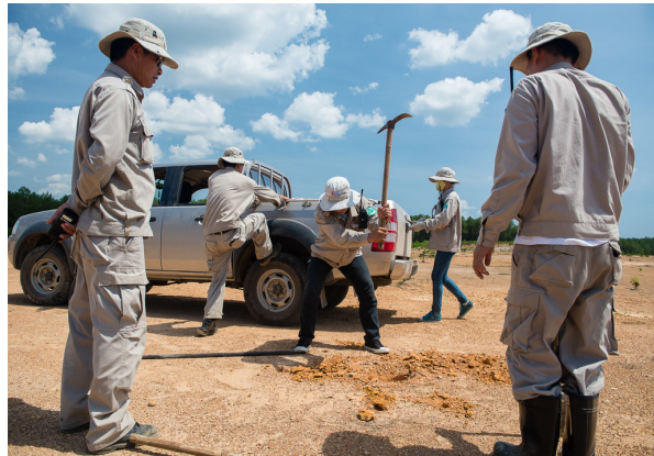
Quang Tri Province, Vietnam, 2013 - A Project RENEW EOD team digs a shallow trench to contain a controlled demolition of an artillery shell.

Project RENEW's work. NPA is a major partner of RENEW and, in addition to supporting the work in Quang Tri, also works in Thua Thien Hue Province further south. I came back to Vietnam in 2014 to spend a week near the ancient city of Hue and photograph NPA's work there.