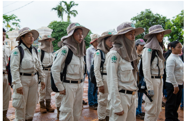
Ban Lung, Ratanakiri Province, Cambodia, 2014 - Early in the morning, the two NPA all-female EOD and survey teams deployed in Ratanakiri Province in Northeast Cambodia line up at the NPA compound for the day's briefing before being driven to their mission.