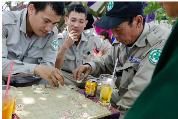
Thua Thien Hue Province, Vietnam, 2014 - After completing the day's ordnance destruction, they go for nonalcoholic drinks at a local café and play checkers.