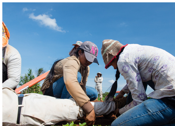
Ban Lung, Ratanakiri Province, Cambodia, 2014 - An NPA deminer supervises a group of new recruits performing a first aid drill in the field behind the NPA compound.

for Ratanakiri Province in the northeast part of the country, 580 km northeast of Phnom Penh – a nine and a half hour drive in 2014 over atrocious roads. (Actually, the teams had three male employees: a driver, a medic, and the computer data specialist.)