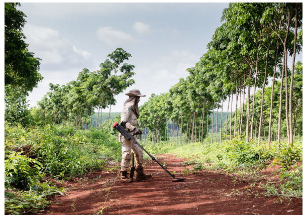
Ratanakiri Province, Cambodia, 2014 - An NPA team conducts a technical survey, looking for any signs of cluster munitions on a plantation near the town of Ban Lung in the Northeastern part of the country.

or floods - or sometimes they just sit there in plain sight. They linger for years or decades, waiting for children or unsuspecting villagers, scrap metal scavengers, or construction workers to wander by.