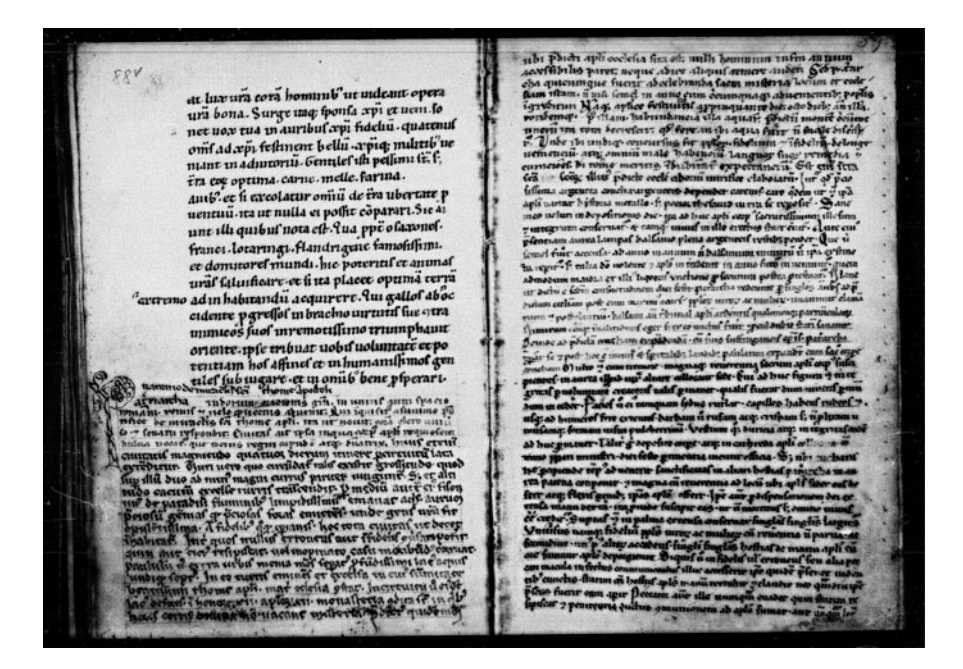
Figure 3: Darmstadt, Cod. 749, fols. 88v–89r, with the Patriarch of India's narrative about the miracles at the tomb of St. Thomas in "Hulna" appended to the Letter of Adelgoz.

proceeded to tell the assembled curia a detailed story about the wonders of his own land and in particular an extraordinary account of the miracles performed at the tomb of St. Thomas the Apostle.<sup>112</sup> The patriarch claims that Thomas's shrine is located in a city of India named Hulna that is watered by the river Physon. Hulna is filled with an exceedingly pious Christian populace devoted to the cult of St. Thomas. No Jew or infidel dares remain in the city. On a nearby mountain, surrounded by a deep lake, is the church of St. Thomas. Once a year, as the apostle's feast day approaches, the lake miraculously dries up and the clergy and people are then able to approach the sanctuary. The body of Thomas is removed from a raft-like sarcophagus hanging in the church and placed on a magnificent throne, where he appears to be a living man. The Christian faithful then