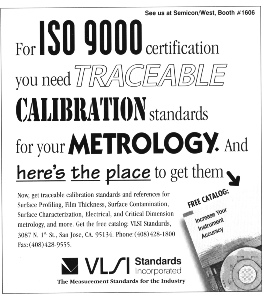
Circle No. 12 on Reader Service Card.

Follow-up experiments have been designed to evaluate the effect that this new driving force has on bulk or grain boundary diffusion as well as for the overall reaction kinetics of (pseudo)binary compound formation. The results of these experiments will be directly applicable to understanding whether (and how) microwaves accelerate solid-state chemical and microstructural reactions in comparison to conventional furnace heating, and how best to employ the effect of the processing of commercial ceramics and glasses.